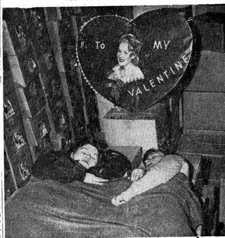
These two young women, along with 16 other members of Local 65, Wholesale and Warehouse Workers Union, called a sit-in strike at the Fuld Co. in N. Y. City where the employer, planning to move out of town, fired them. A few years ago the loss of a job didn't mean so much because there were new ones to be found. But now, with unemployment rising steadily, it really hurts.