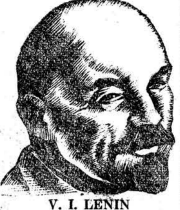
V. I. LENIN

And this "fanatic" not only propagated these views. It seemed to him quite reasonable that men should organize and struggle against this monstrous fate that a bankrupt society was preparing for them. As a Marxist, he saw that this struggle rested primarily on the working-class as the mortal enemy of capitalist society because of its role in production. He proposed to organize this struggle, devoted his life to it, and called upon all who thought or felt as he did to do the same. He refused to compromise on these basic principles and fought against all who attempted to introduce into the labor movement any illusions connected with increasing democracy, increasing prosperity, etc. under capitalism.