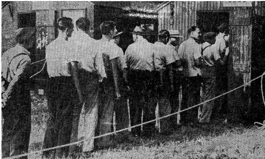
Ford workers in Michigan, like these shown lined up at a polling booth, cast an 87% majority vote for strike action to win union demands for wage boosts, pension and health insurance.