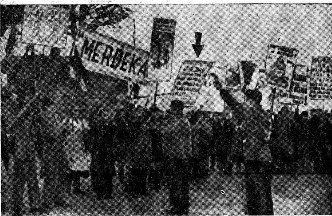
Indonesians living in Tokyo, Japan, stage demonstration before Netherlands Mission protesting Dutch aggression against their homeland. Placard (arrow) says: "Dear Tojo: Though you've been hanged, we uphold your Pearl Harbor spirit! Very truly yours, Dutch Militarists." Merdeka means Freedom in Indonesian.

vestments, guaranteed by the government.