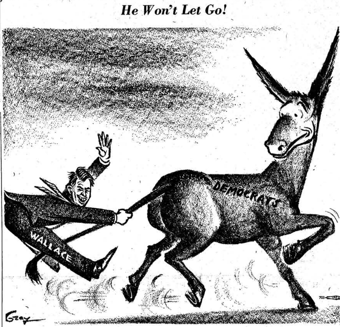
He Won't Let Go!

Next week's Militant will complete roundup of all states where the SWP is on the ballot and of all candidates running on the ticket in local elections.