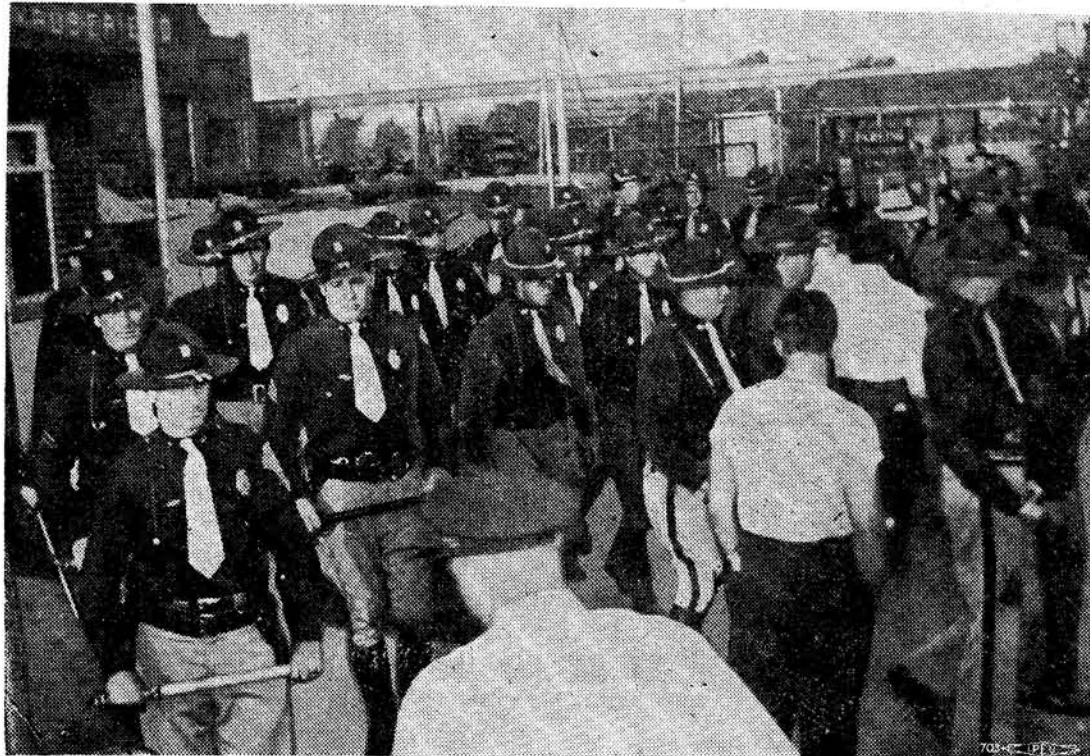
This solid wall of armed Indiana state troopers broke the strike of CIO United Electrical members at the Bucyrus-Erie plant in Evansville. Congressmen from the Hartley Committee moved in then and helped smash up the local union.

SAN FRANCISCO, Oct. 3.—The Pacific Coast maritime strike which began Sept. 2 settled down last week to the "battle of the ads" between Waterfront Employers and the striking unions.