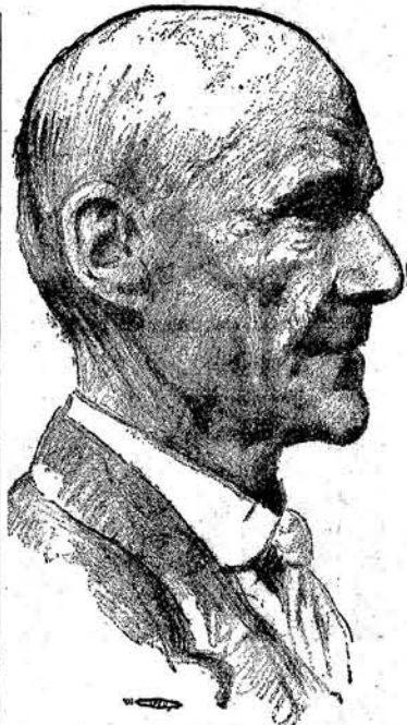
EUGENE V. DEBS

Debs referred, of course, to the Bolshevik party of Lenin and Trotsky. Had he lived to see Stalin betray the world working class, we are confident that Debs, the international socialist, would have supported the Trotskyist movement in our 25-year struggle