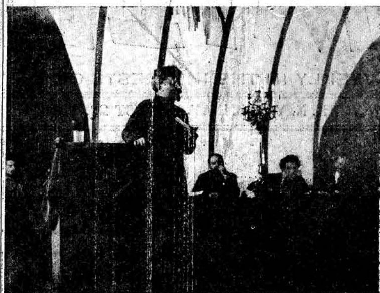
This rare picture shows Leon Trotsky, then co-leader with Lenin of the Soviet Union, as he addressed the Second World Congress of the Third International in 1920.

Stalin and his gang of bureaucratic usurpers brutally expelled Trotsky and the Left Oppositionists from the Russian Communist Party in 1927. Then, in 1928, the unfolding economic crisis in Russia forced Stalin to adopt — in highly distorted form — Trotsky's program for industrialization. Bureaucratic planning, devoid of mass initiative and participation,