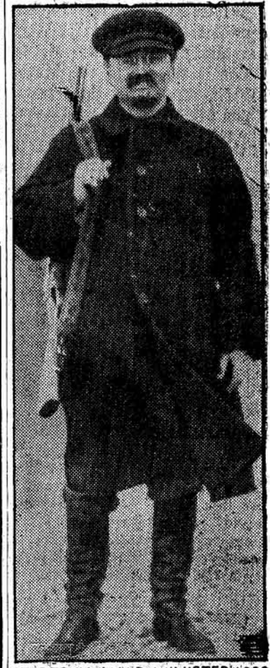
TROTSKY, WAR MINISTER 1924

The building of his world party, the continuation and development of his struggle through this party, is the greatest monument to Trotsky's memory. He would have wanted no other.