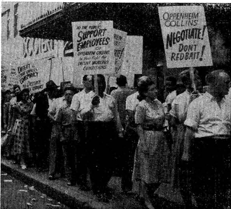
CIO members picket Oppenheim Collins Dept. Store in New York extorting management to "Negotiate, Don't Redbait." The Stalinist-led union is trying to save its bargaining rights from a joint employer-government-AFL attack.