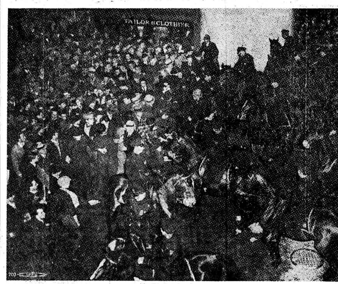
This is the kind of class action the SWP stands for. When the German-American Bund attempted to hold a fascist meeting in Madison Square Garden Feb. 20, 1939, 50,000 workers answered the SWP's call for an anti-fascist labor rally. Photo shows cops riding their horses into the crowd of workers, in an attempt to protect the fascists.