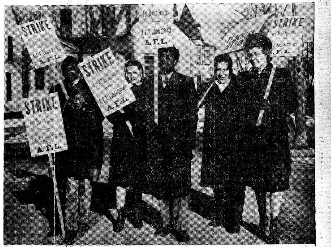
Grace Carlson didn't become an advocate for workers rights just for the purposes of an election campaign, as is usually the case with vice-presidential and presidential candidates. Here she is shown walking the picket line with St. Paul, Minn. teachers when they staged the largest teachers strike in history in November 1946.

button or so to wear if your party has any. Would you kindly let me know where in Philadelphia I can contact your party as I have been an independent voter for ten years.