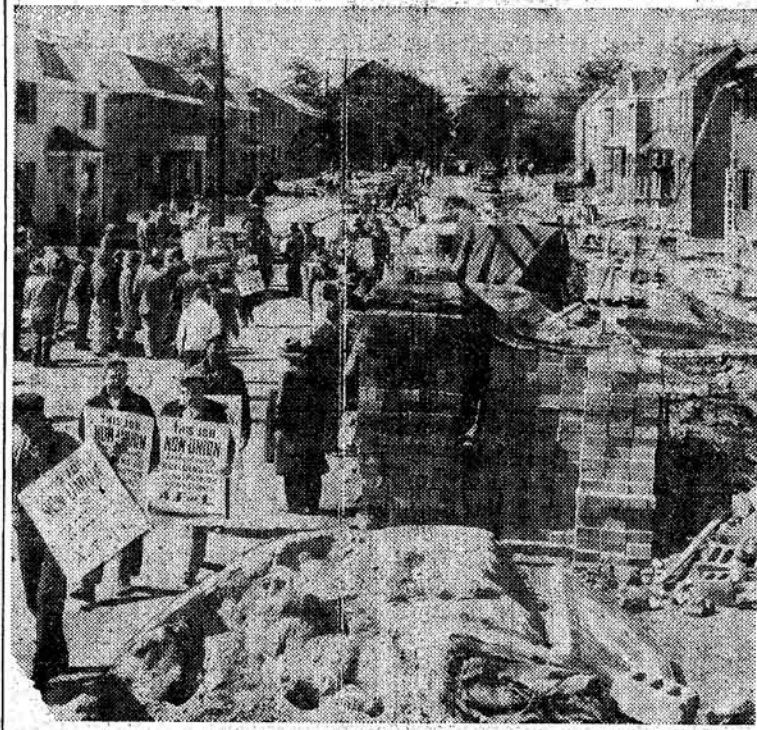
Pickets from a number of AFL building trades unions went into action against the 12 million dollar Ivy Hill housing project in Newark, N. J., after the construction company announced an open shop policy and fired 300 workers.