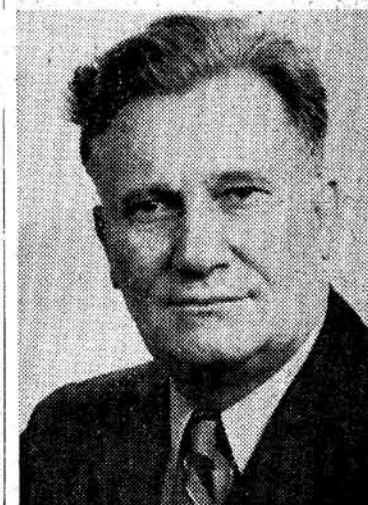
JAMES P. CANNON

Farrell Dobbs, the presidential candidate of the Socialist Work-