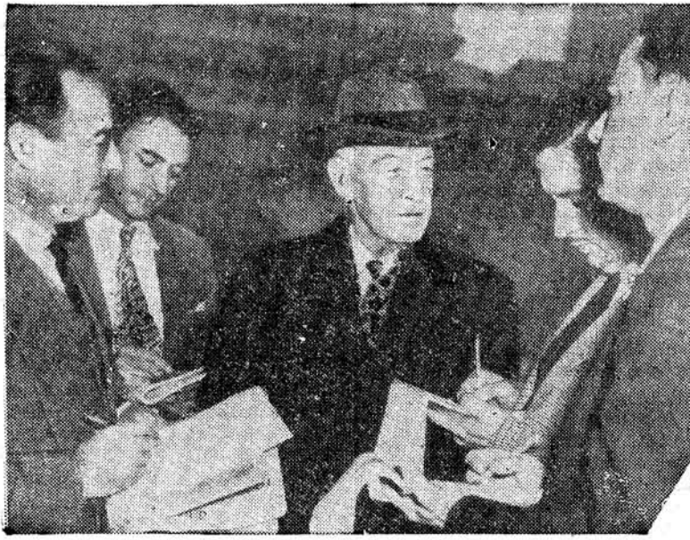
Frank T. Himes, U. S. Ambassador to Panama (center) meets with President Truman. After the Panama Government refused to renew leases for the bases, the U. S. announced it was evacuating its forces.

Europe—the basis of all prosperity—was not even attempted. This would involve the reconstruction of all the means of production in Europe to permit a considerable increase in exports. Only thus could the equilibrium of trade balances of the nations be assured.