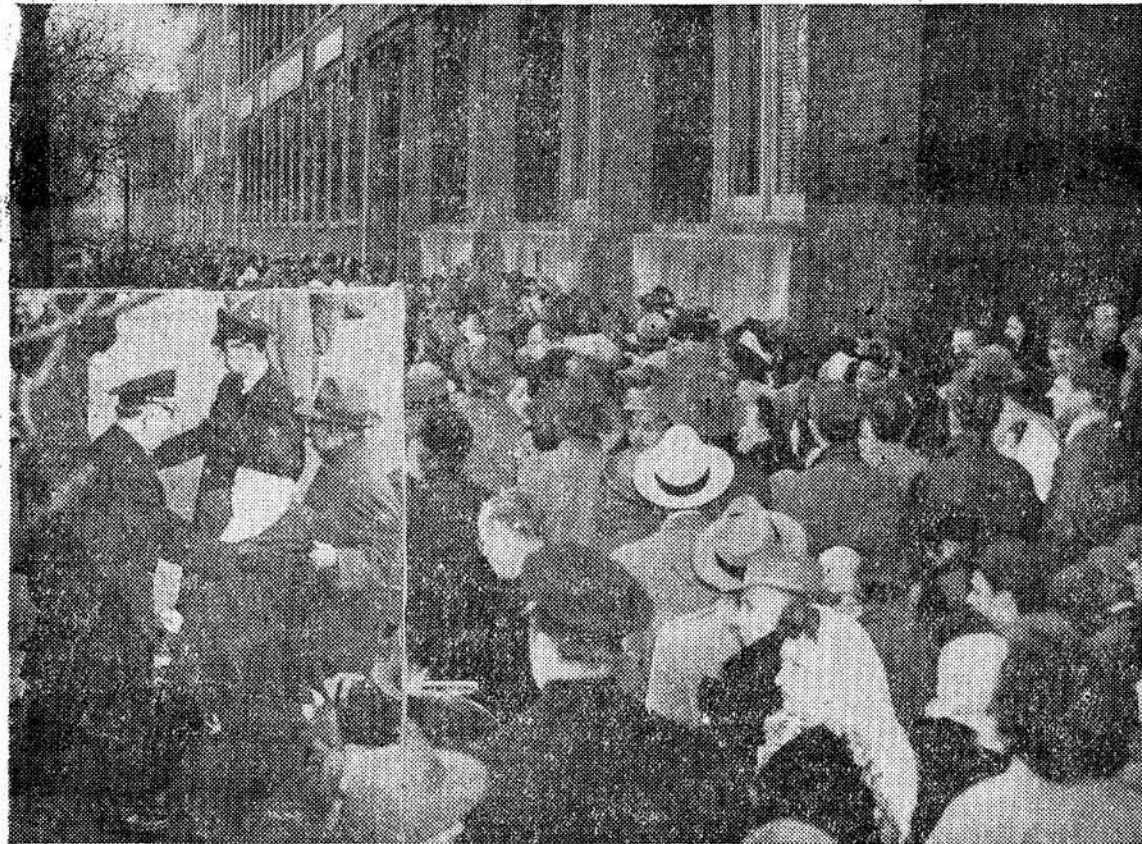
These CIO members turned out to support the strike of Local 1150, CIO United Electrical, Radio & Machine Workers against the Cory Corp. Chicago cops showed up too, roughed up the pickets (left) and arrested more than 170 men and women.