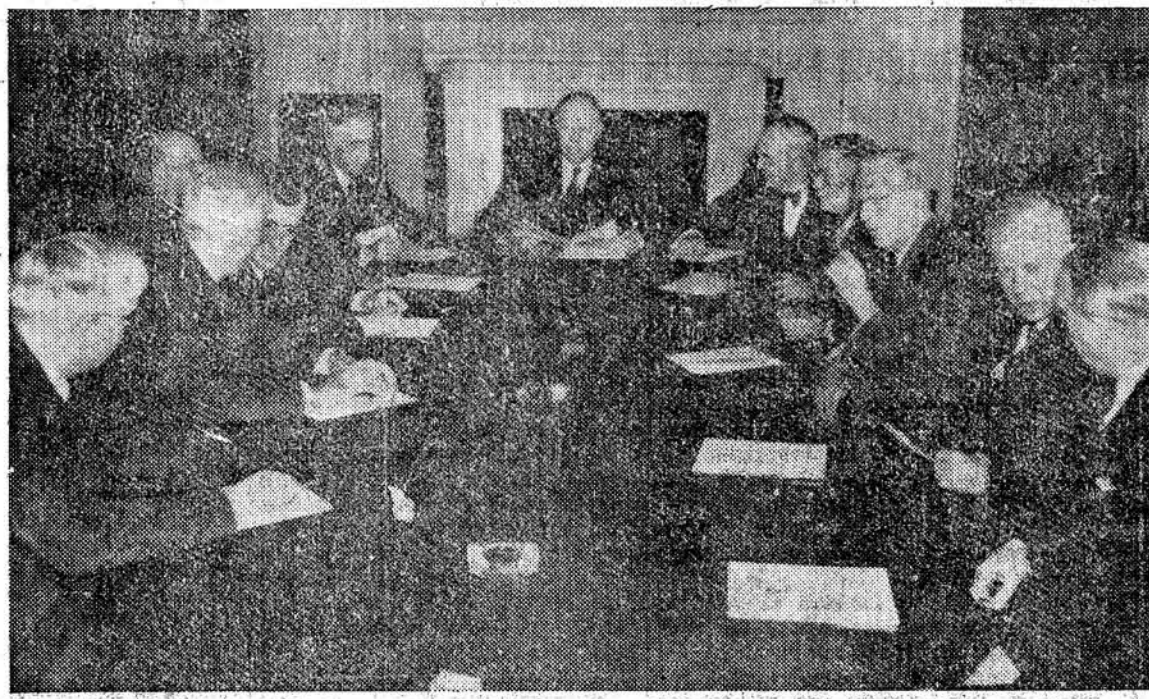
Senator Robert A. Taft (center of table) confers with top GOP Congressional leaders on ways and means to blame Democrats for high prices, while Truman and Democrats hold similar sessions to figure how to blame Republicans. Neither party of ers an effective program, both are using the issue as a political football.