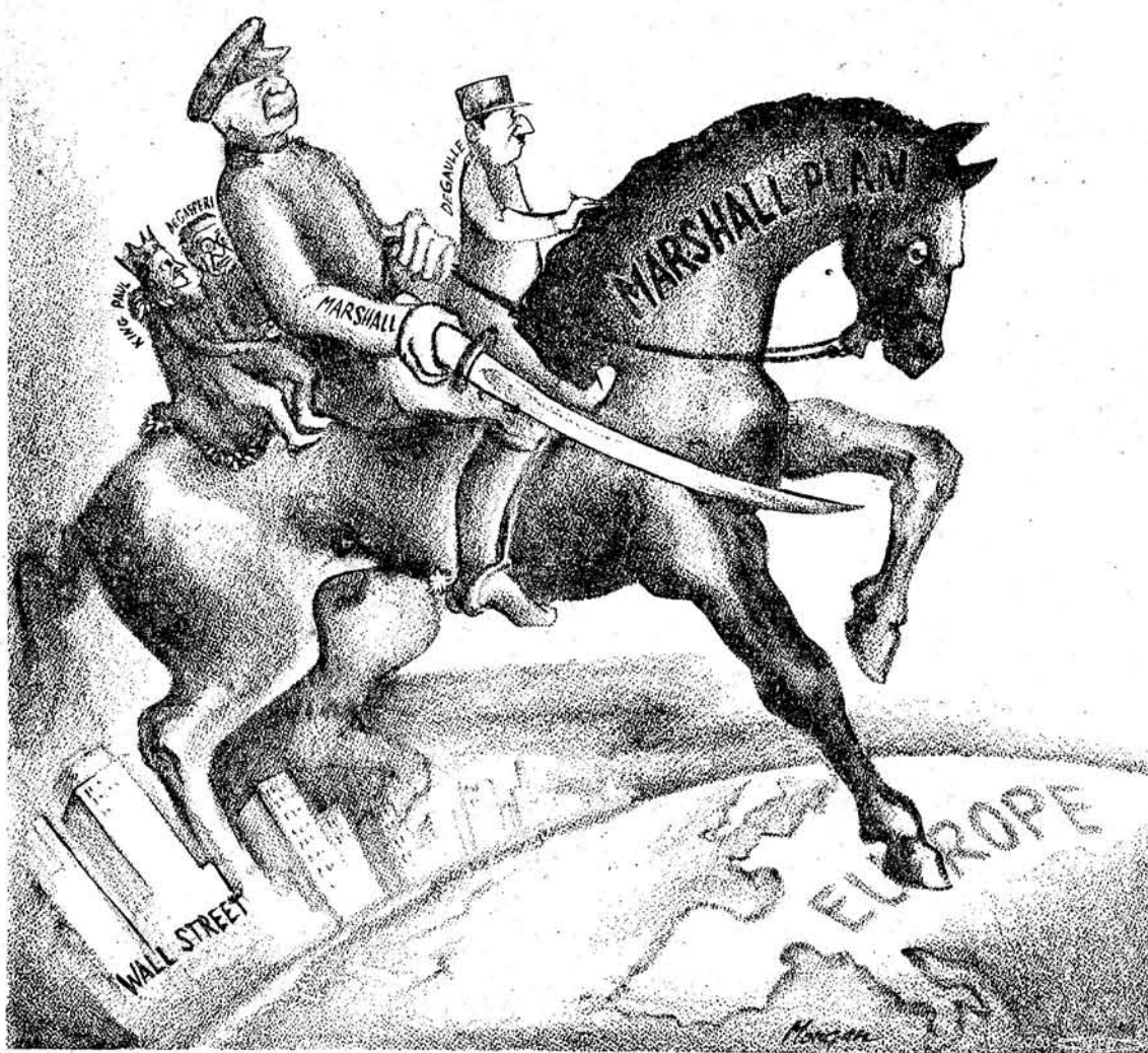
The Men on Horseback