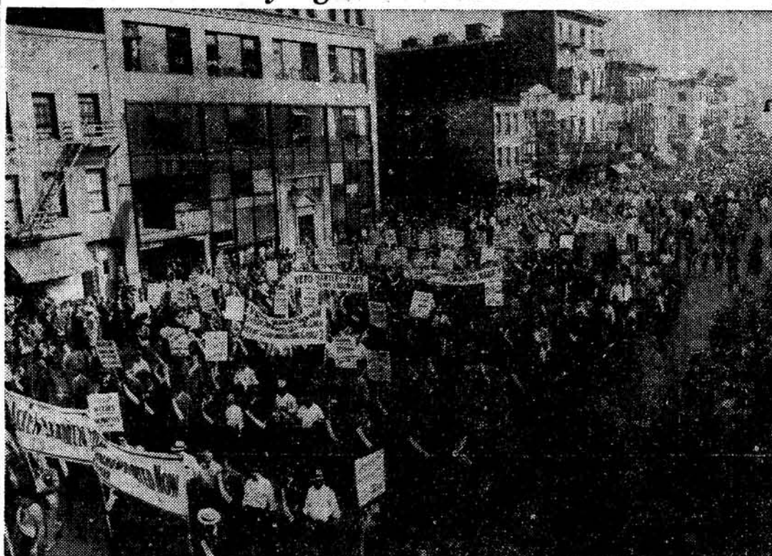
120,000 CIO members in New York, marching 16 abreast, paraded four and a half hours before gathering at Madison Square Garden to protest the Taft-Hartley anti-labor bill. About half a million New Yorkers lined the streets to watch one of the biggest labor demonstrations in the city's history.