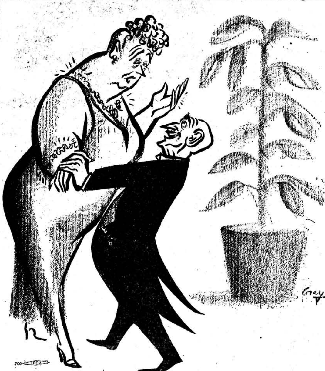
"After all, Baron, it's only right that the smaller countries should look up to us."

If the labor movement does its part, if it shows to these veterans a program of genuine opportunity in a society without class distinction and favoritism, in a socialist world of planned security and plenty, they will join the shock troops of the aroused and advancing working class. Their knowledge and skills, gained in the experiences of war as well as in the college classrooms, will be a great reservoir from which labor can draw reserves of leadership and power in the emancipating struggle against capitalism.