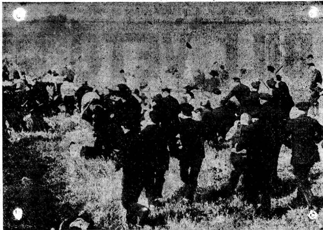
On Memorial Day, 1937, ten workers were murdered by Chicago police during a holiday strike parade. This photograph was taken from a suppressed newsreel of the brutal assault upon unarmed men, women and children. The pictures were hastily withdrawn from circulation because Mayor Kelly feared their showing might "incite riots" among horrified Chicago workers.

ultaneously in a heap. The massive, sustained roar of the police pistols lasts perhaps two or three seconds. Instantly the police charge on the marchers with riot sticks flying. At the same time tear gas grenades are seen sailing into the mass of demonstrators, and