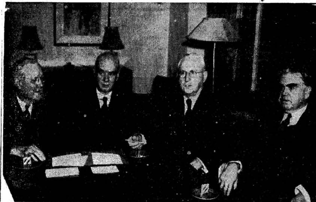
Top leaders of the AFL and CIO shown in Washington, at a conference to discuss the possibility of merger. No agreement was reached when the AFL leaders rejected CIO demands for guarantees to preserve industrial unionism. Left to right: AFL President William Green, CIO President Philip Murray, President Dan Tobin of the AFL International Brotherhood of Teamsters, and John L. Lewis of the AFL United Mine Workers.