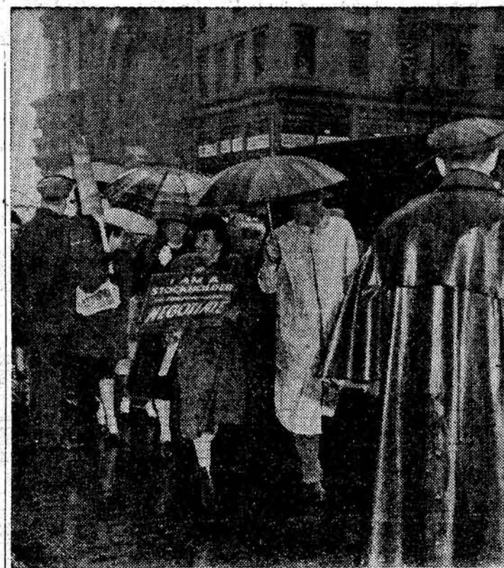
Disregarding the driving rain, telephone workers (and a stockholder) picketed the annual stockholders meeting at the AT&T building in New York. Inside, the telephone union lawyer charged AT&T directors with "hatching a conspiracy" against labor.