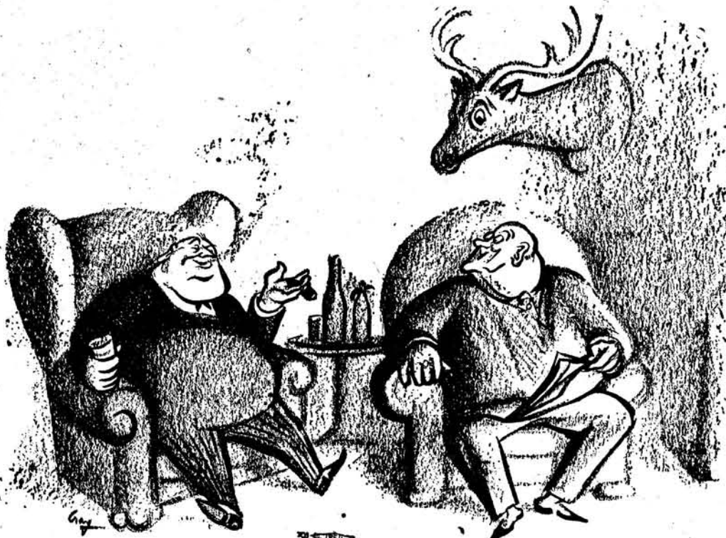
"With this omnibus labor bill, we can really take the workers for a ride."

Four Jewish youths swinging from a British gallows! On each of them it would be fitting for the victorious Allies to pin a placard inscribed with one of the "four freedoms" promised the peoples of the earth, for these four youths were guilty of trying to bring those four freedoms to Palestine.