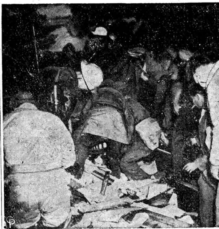
Rescue workers search through the mangled wreckage of the Texas City Monsanto Chemical factory for bodies of victims caught in the blasts and fires that demolished the city.