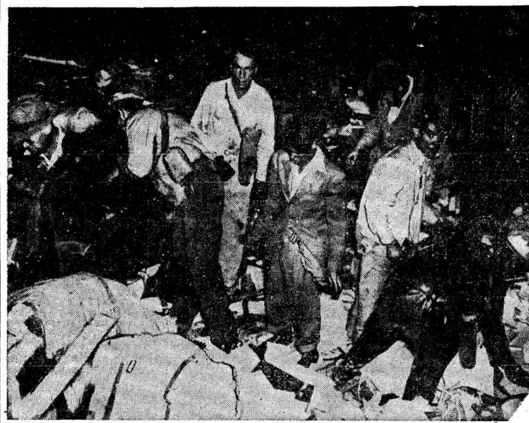
By lantern light and the glow of flaming debris, rescue workers dig for victims of the Texas City disaster that killed hundreds, wounded thousands, and laid waste the entire city.

pyre were received. People were shaken not only by the deaths and destruction but by dire foreboding that this Texas catastrophe was a preview of the destructive powers that can be unleashed in atomic warfare.