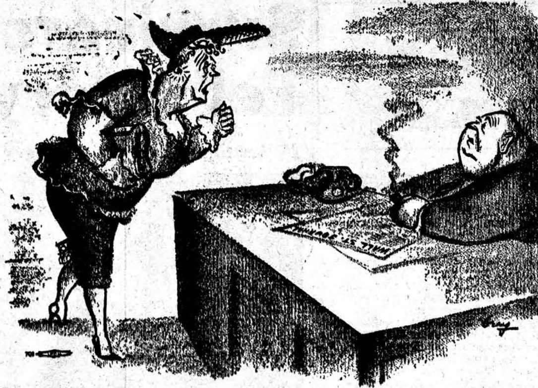
"Imagine! I had to fly all the way up from Florida because I couldn't get you on the phone."