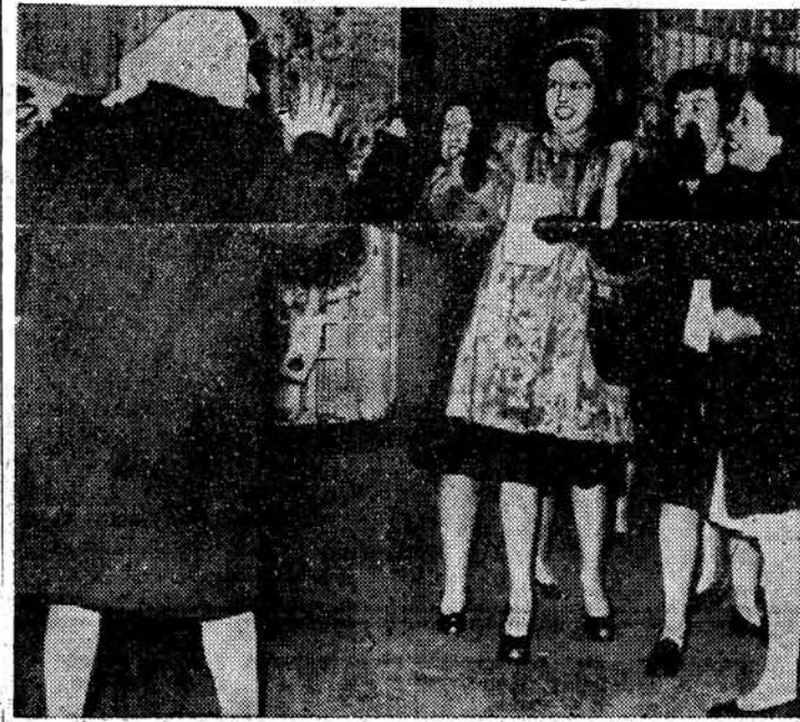
A scab crossing the picket line outside the Bell Telephone monopoly's Chicago exchange gets an earful from the striking telephone girls. Solidly behind the strike are 325,000 phone workers throughout the country.