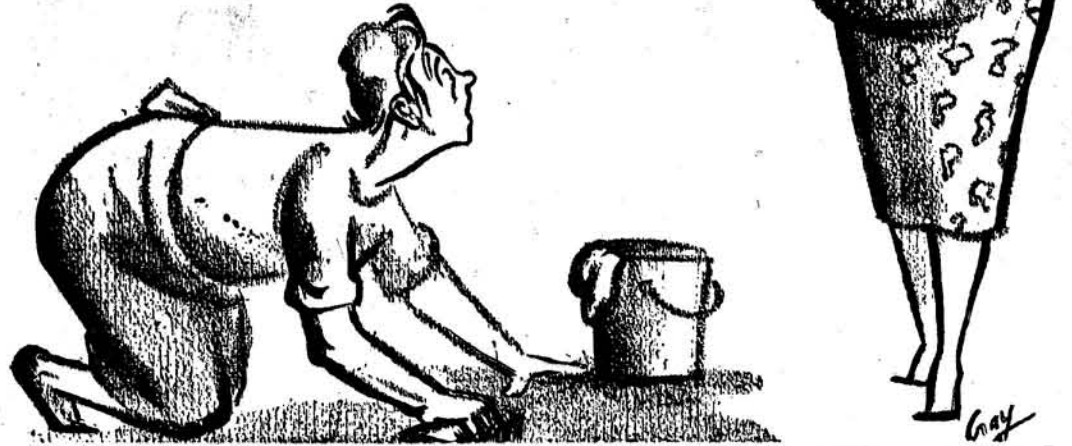
"Of course you'll have to take a loyalty test, you know, before I can put you on steady!"

It is in the interests of the American workers to demand the immediate withdrawal of all the armies of occupation from Germany. Let the German workers take power! An end to the policy of bolstering capitalist reaction in Germany!