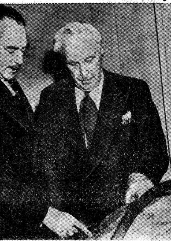
Acting Secretary of State Dean Acheson chats with Chairman Charles Eaton (R., N. J.) of the House Foreign Affairs Committee after indicating in his testimony that U. S. military intervention in Greece and Turkey is only the beginning.