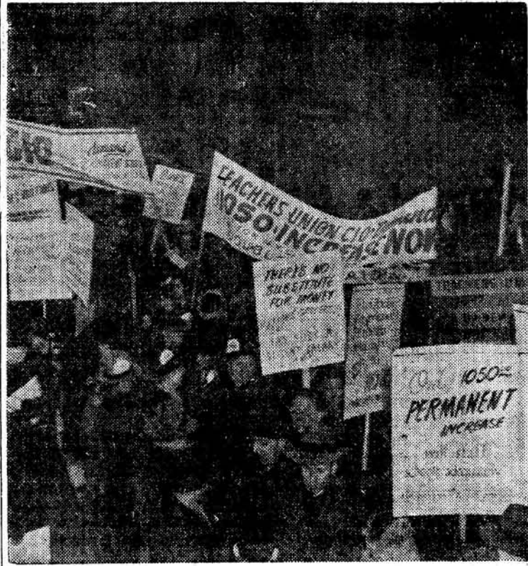
Continuing their campaign for higher wages, thousands of New York City teachers picketed the building where a budget hearing is in progress. Members of the Teachers Salary Conference, to which both AFL and CIO teachers unions belong, participated in the recent demonstration.

year history of the local union. He also had been a supporter of the no-strike pledge.