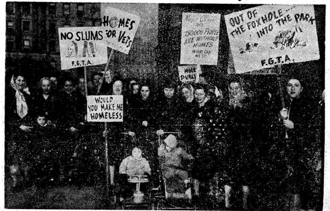
These tenants, now living in a New York low-rent project, picket the offices of Mayor William O'Dwyer to protest attempts to evict all tenants with incomes above the present very low limit. "Out of the Foxhole into the Park," one placard reads.