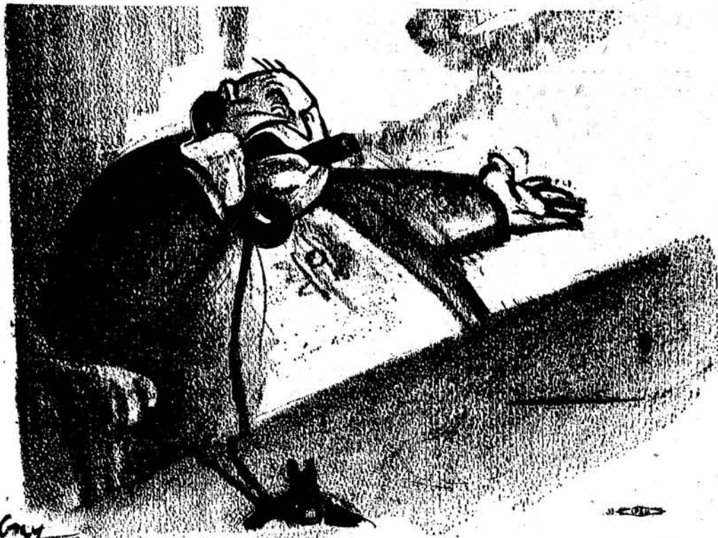
"I don't care what it costs — move that plant gate up to the belt line! I ain't paying portal-to-portal!"

M. E. Thompson, who would be the contestant in the plebiscite, has been described as a "liberal." But Thompson is not one whit cleaner than his foul rival. Thompson is a "liberal" who stands committed to Talmadge's lynch law program of Negro-hating, Jew-baiting, anti-labor, Jim Crow, white supremacy. He has refused to participate in the proposed plebiscite only because he sees nothing to gain from it.