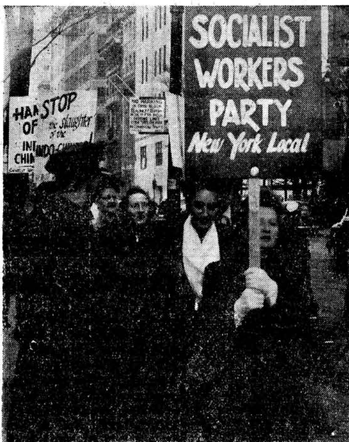
Part of the contingent of 125 Socialist Workers Party members and sympathizers who participated last Saturday in a picket-line demonstration before the French Consulate in New York City to protest French imperialist butchery of the Indo-Chinese people. (Story on P. 1.)