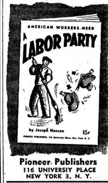
Pioneer Publishers 116 UNIVERSITY PLACE NEW YORK 3, N. Y.

HOTEL DIPLOMAT 108 West 43rd St., New York Auspices: Socialist Workers Party