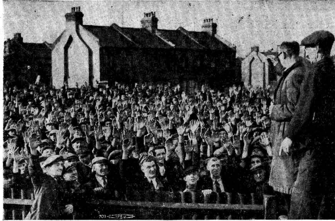
London longshoremen doom the back-to-work movement of the union officialdom by voting to keep their strike solid. The dock workers are demanding $5 a day—an increase of $1.90—a 40-hour week, abolition of piece-work, improved medical services, and in the case of the Liverpool committee, reorganization of the Transport and General Workers Union.

The British dock strike continues solid despite the efforts of the Government, union officials and Stalinists to break it. Estimates of the number of strikers range as high as 50,000.