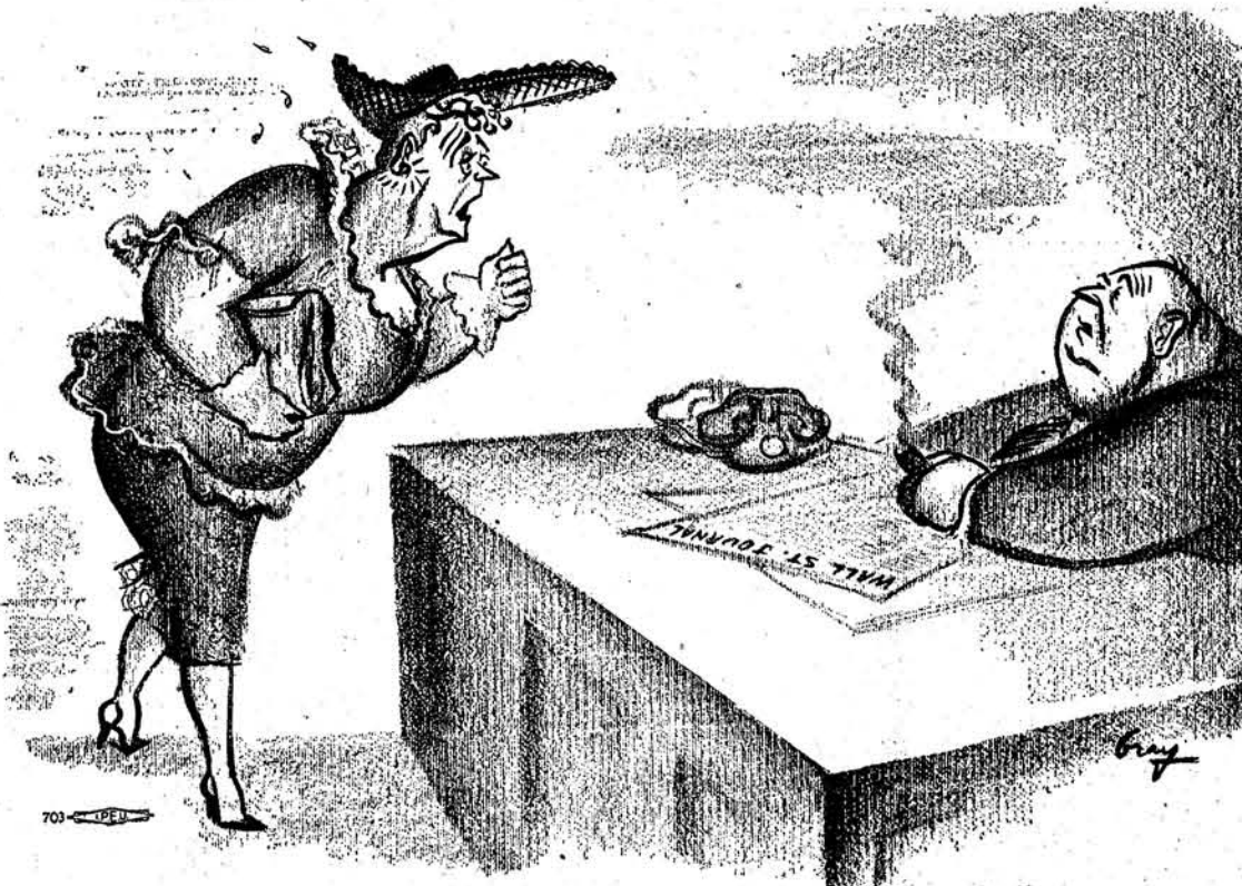
"The cook threatened to strike — can't we have her arrested under your Smith-whatcha-ma-callit law?"

The Los Angeles CIO has started the defense of American labor against native fascism. Now it must be followed up throughout the entire country!