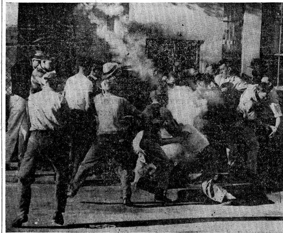
The war for "democracy" didn't end this. Police at Elkhart, Ind., on June 26, hurl tear gas and smash a peaceful picket line at the North Indiana Brass Company plant.