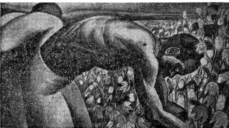
This is a drawing of a Negro agricultural worker at his toil. These workers are among the most cruelly exploited of the millions of sub-standard wage-earners in America.