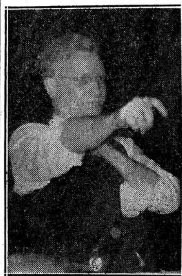
JAMES P. CANNON

Readers of The Militant will undoubtedly be eager to hear