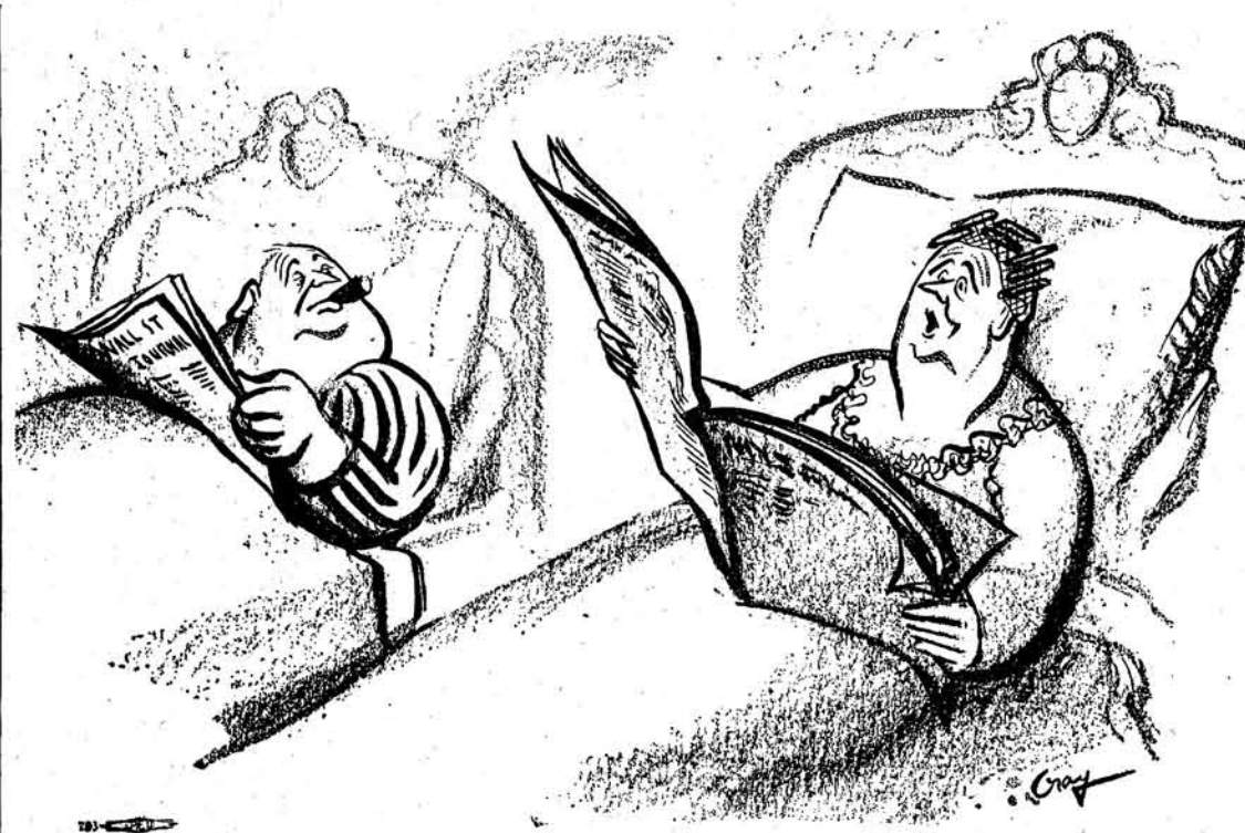
"Servants are so independent these days — why don't we get some of those German prisoners to work for us?"

Could it be that Senator La Follette is not at all a tribune of the people, but simply a political spokesman of Yankee imperialism?