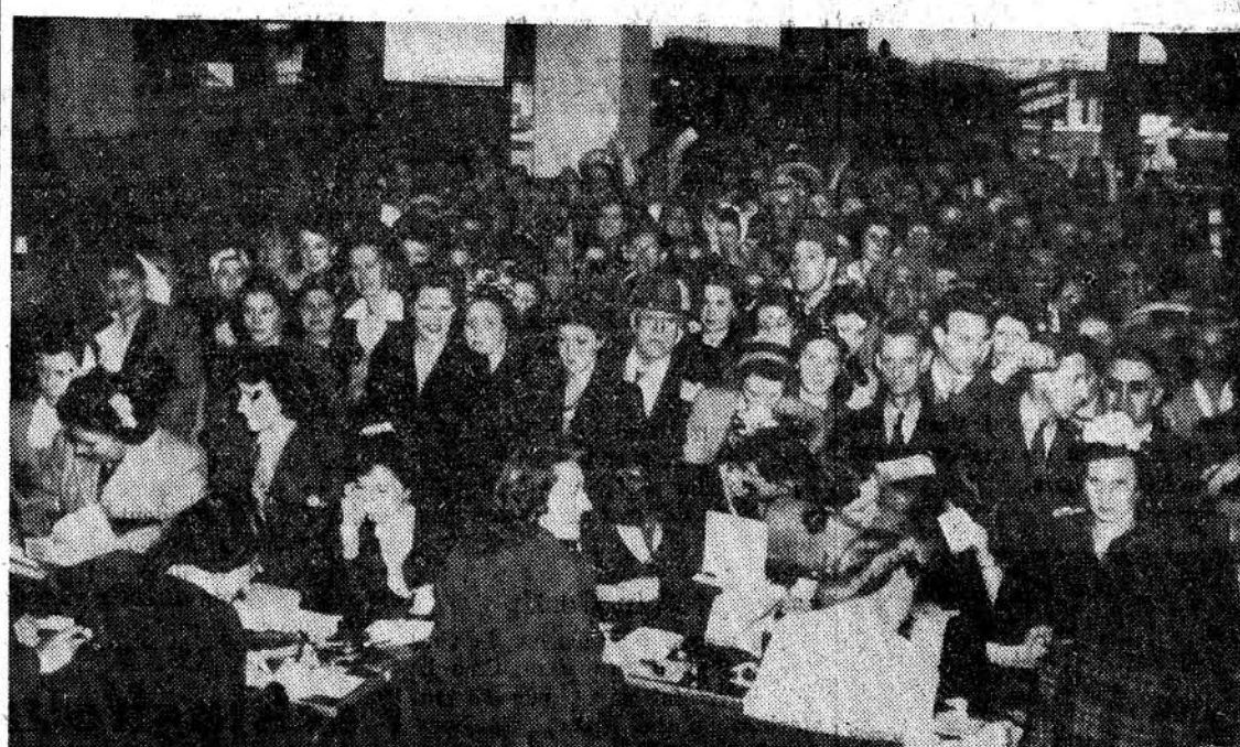
Hundreds of war workers, laid off as a result of army plane cutbacks in Buffalo, N. Y. plane plant, jammed the State Division of Placement and Unemployment offices on May 31 to file unemployment benefit applications.