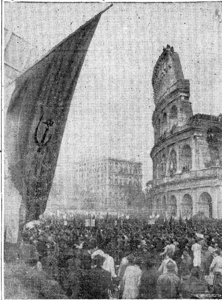
Dramatic photograph of the huge working class demonstration at the Colosseum in Rome on March 6 in protest against the "escape" of the fascist General Roatta.