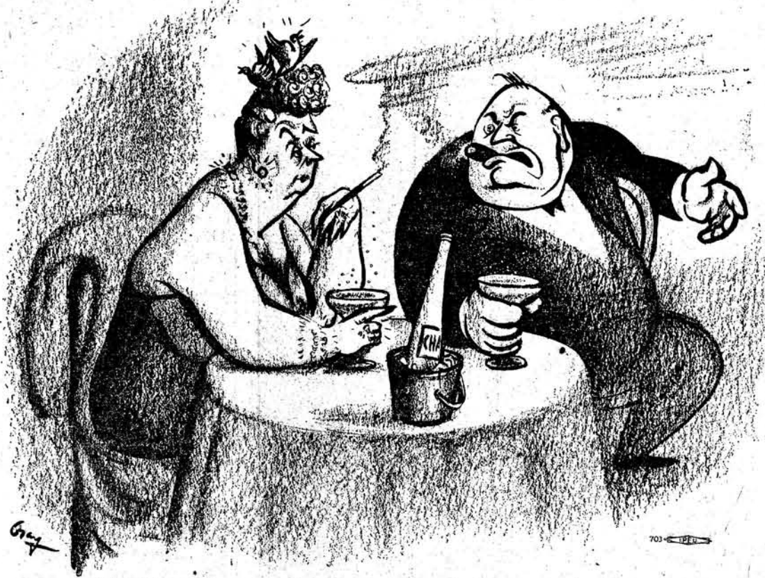
HE: "Imagine those miners asking for more money while WE'RE fighting this war!"

Even the movies have been pressed into service to give the public false impressions about the miners' living conditions. Power Unlimited, an RKO "educational" film, has just been released to 8,000 theatres, throughout the country. The United Mine Workers Journal criticizes "the impression it gives that all is lovely and picturesque in a great number of mining communities owned by coal operators. Shots of a modern beauty parlor, a well-stocked and well-kept company store and a slightly ultra swimming pool, along with the narrator's explanation that these are the means by which solicitous operators endeavor to keep their