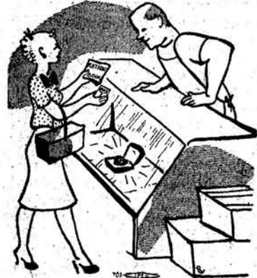
"One Meat Ball"

All told the same mournful story. Despite the greatest profits in their history—ranging as much as 1,000 per cent above the pre-war period—they were on their