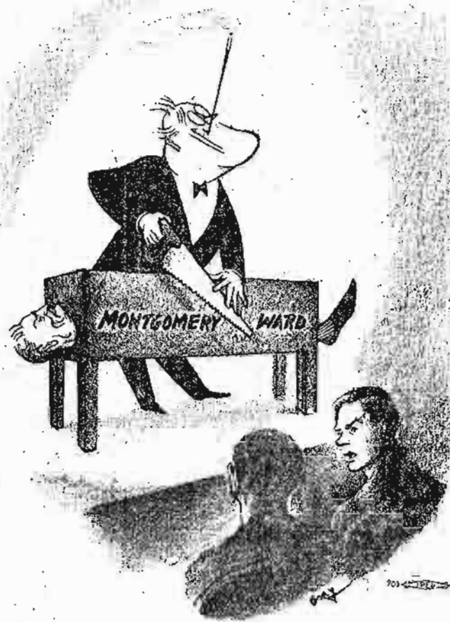
"This Is Where We Came In!"