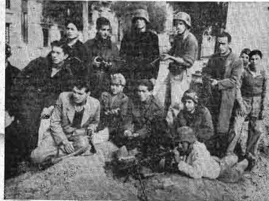
Young ELAS fighters in Piraeus, seaport of Athens, during the first weeks of the British attack upon their forces, display the arms—small rifles and machine-guns—with which they heroically fought off British tanks, heavy artillery, and bombers.

In the "Review of the Month" the editors discuss the results of the 1944 Presidential elections. They point out that, contrary to a superficial impression, Roosevelt's reelection for a fourth term really marks a further stage in the breakdown of the capitalist two-party system in America. They analyze the many factors which indicate the growing desire of the advanced workers for an independent labor party.