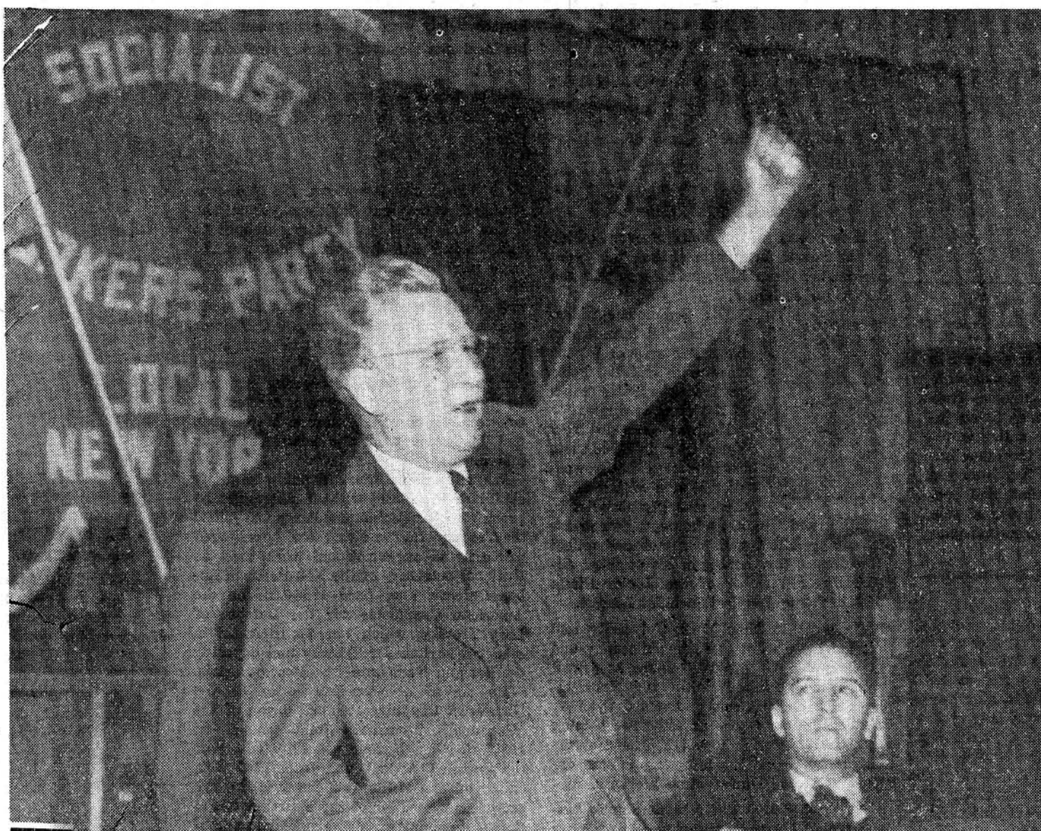
"Our party didn't sell out, didn't lie. We told the truth. That is why we are being railroaded to prison." James P. Cannon, National Secretary of the Socialist Workers Party and one of the 18 Minneapolis prisoners, hurled this challenge at the capitalist class, its government and its courts in his historic speech at the Farewell Banquet in New York.

"An intensive campaign is required for the internal preparation of the party to withstand the blow of Federal prosecution. The only people who can stand up under this kind of governmental pressure are people who have a historical outlook and a profound understanding of what they are fighting for. Mere activism, sometimes sufficient for day to day work, is not enough to stand up under the blows of persecution. . . The difference between a trade union militant and a politically educated Trotskyist is immeasurable; it is qualitative. The best of yesterday's trade union militants are today succumbing under the pressure of the war situation. Only those will survive who are not only rooted in the working class movement but who have the Marxist