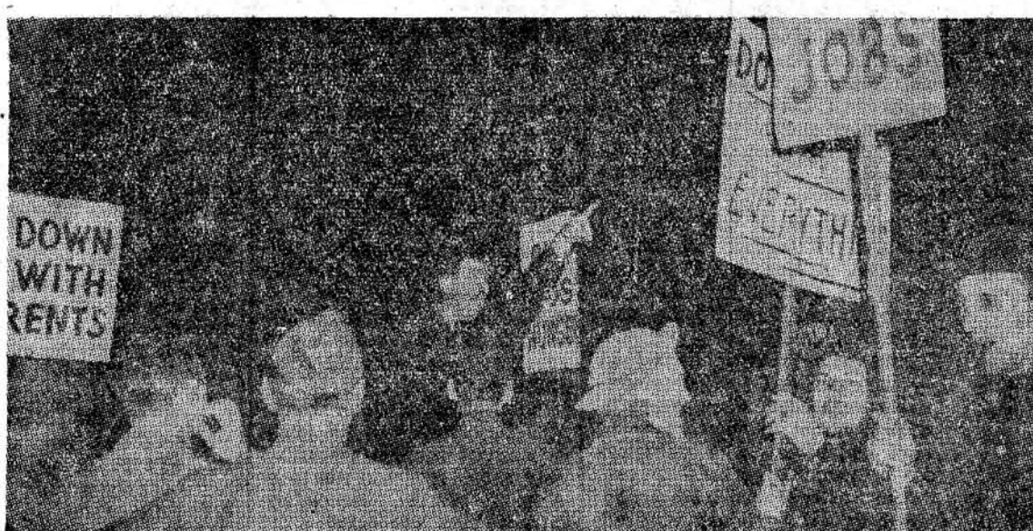
Members of the New York State Guard dressed as workers are harangued by an "agitator" in "realistic" drill staged by Wall Street Colonel. Other guardsmen armed with two-foot oak clubs dispersed the "agitators" who are seen carrying picket signs reading: "Our Kids Are Hungry," "We Want Jobs," etc.

His voice was filled with scorn as he described the role of the "liberal" U. S. Supreme Court which refused even to hear an appeal on the case.