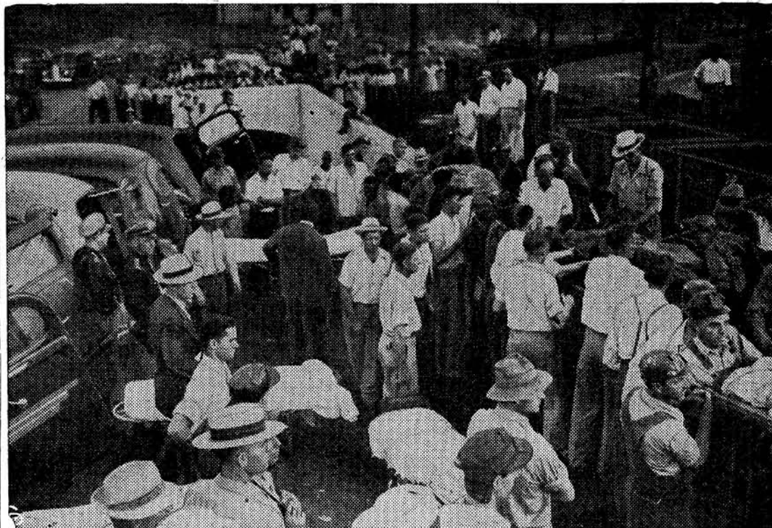
The bodies of 19 miners and rescue workers killed in a double explosion which rocked the Republic Steel Corporation's Sayreton No. 2 mine at Sayreton, Ala., are shown reaching the surface of the mine. Members of the United Mine Workers, the dead included four volunteer rescue workers, trapped in second explosion. See Page 2 of this issue for a comprehensive feature article on conditions and accidents in the mines.