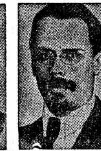
MILIUTIN Purged by Stalin