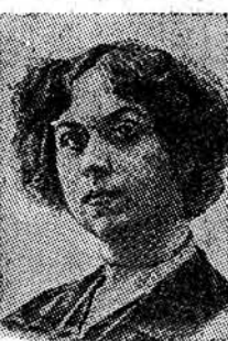
KOLLONTAI Purged by Stalin