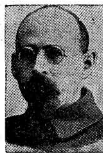
KRESTINSKY Shot by Stalin