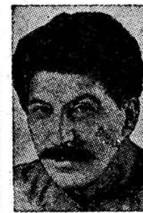
STALIN Sole survivor