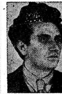
ZINOVIEV Shot by Stalin