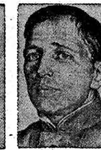
BUBNOV Purged by Stalin