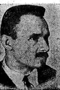
LOMOV Purged by Stalin