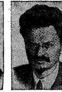
TROTSKY Killed by Stalin