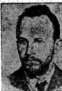
BUKHARIN Shot by Stalin