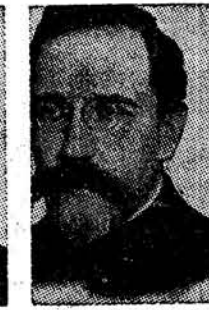
KAMENEV Shot by Stalin