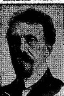
RYKOV Shot by Stalin