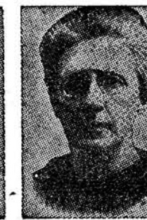
STASSOVA Purged by Stalin