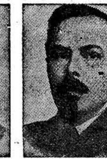
SOKOLNIKOV Shot by Stalin