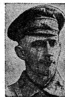
SMILGA Shot by Stalin