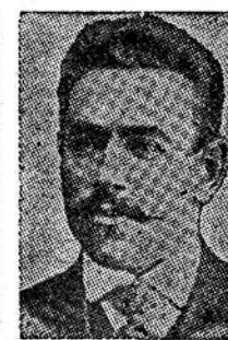
MURANOV Purged by Stalin