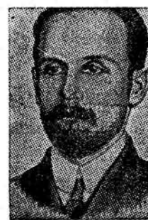
BERZIN Purged by Stalin