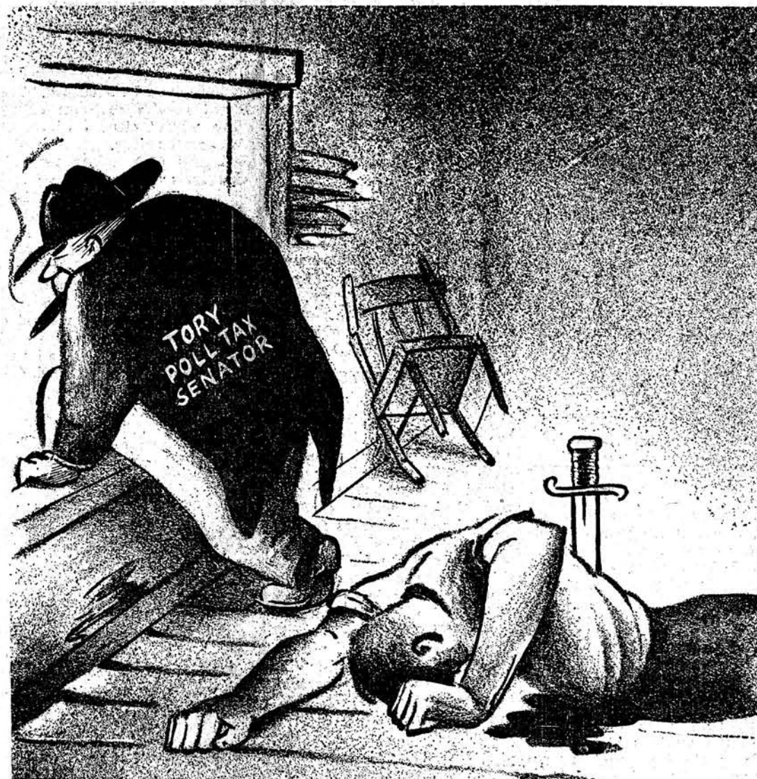
(Federated Pictures Cartoon)

These powers will not necessarily be put into effect immediately or at one blow. But the process of the gradual reduction of the union movement to a mere appendage of the government, has speeded up by this decree.