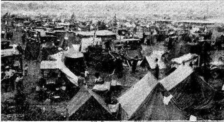
Veterans' shacks at Pennsylvania Avenue and 3rd Street after they were set afire by troops.

For these tens of thousands to come penniless across the country was possible only because everywhere they found the masses actively in sympathy with them. Everywhere the unemployed, with sound instinct, understood that the B. E. F. was breaking a path to Washington which could later be followed