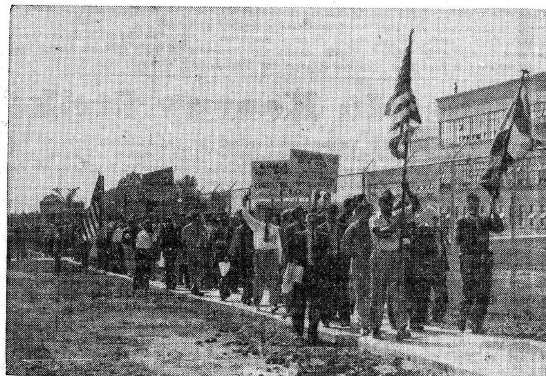
Delegates to the Sixth Annual Convention of the United Automobile, Aircraft and Agricultural Implement Workers (CIO), in Buffalo, are shown as they parade before the Curtiss-Wright aircraft plant to launch the national aircraft organizing drive voted by the convention. The delegates took time out from their important deliberations to show the aircraft bosses they mean business.