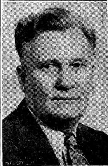
JAMES P. CANNON