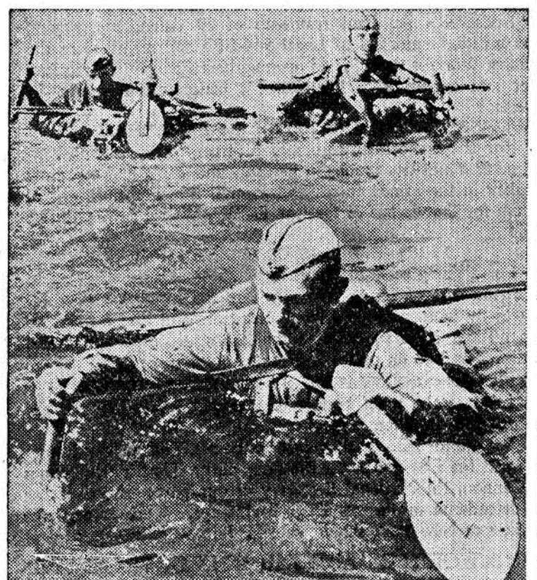
Fully-equipped Red Army troops, shown in this radio-photo from Moscow, are seen crossing a river with the aid of paddles and supported by small air-filled rubber bladders.