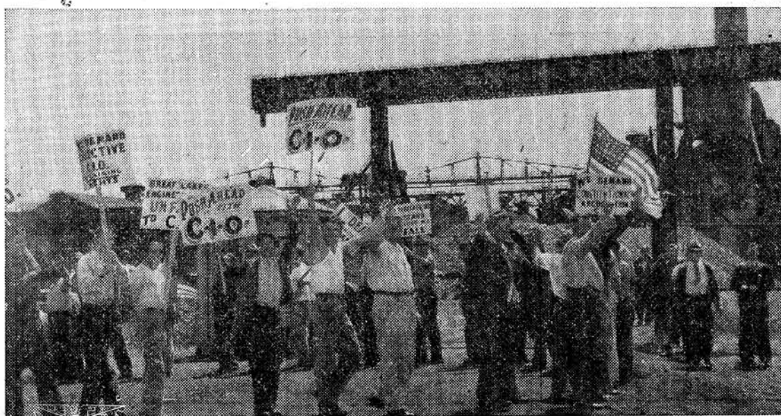
Striking members of the Steel Workers Organizing Committee (CIO) are shown picketing the Great Lakes Engineering Works, largest shipyard on the Great Lakes. The union, representing the 600 workers of the company, is demanding union recognition and exclusive bargaining rights. The strike was precipitated by the company when it refused to deal with the SWOC

monstration. Scores were trampled and clubbed. Workers were arrested, and were roughed up by the police in the station house. Fritz Kuhn concluded his talk by thanking "New York's finest, the police department, for the splendid protection it has given."