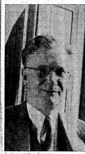
JAMES P. CANNON