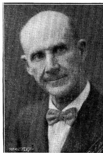
EUGENE V. DEBS

Workers the world over will pay tribute on this August 4, the 27th anniversary of the start of World War I, to the memory of these three proletarian anti-war fighters and martyrs of the 1914-1918 imperialist holocaust. Karl Liebknecht and Rosa Luxemburg were jailed in the Kaiser's prisons for their denunciation of the war. Released by the revolution they had inspired, they were kidnapped and murdered in 1919 by Junker officers in the service of the Social Democratic government. Eugene V. Debs was thrown into a federal penitentiary by the Wilson administration for opposing the war, and died from illness brought on by his five years behind prison bars.