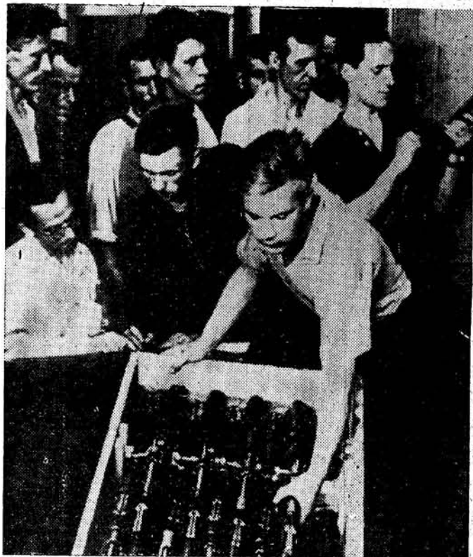
This radiophoto from Moscow shows a group of Soviet civilian workers receiving rifles. Many millions of workers and peasants are reported being armed for guerilla warfare.