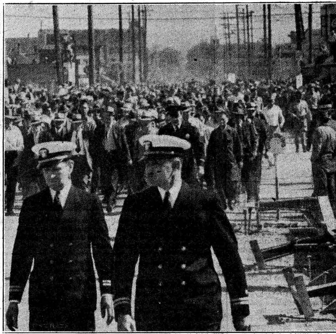
Land-going officers of the U. S. Navy shown leading a few hundred scabs into one of the 11 struck San Francisco shipyards in an unsuccessful attempt to break the strike of 1900 AFL and CIO machinists. The strikers have resisted the combined strikebreaking intervention of the National Mediation Board, the OPM, the Navy Department and top AFL officials. The walkout began on May 8.