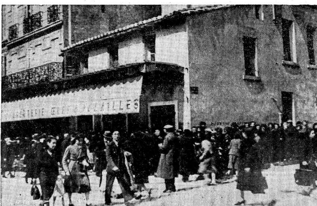
Conditions in France, under the rule of the former "democrats" of the Vichy regime who have made their peace with Hitler, are shown in this scene of Marseilles housewives standing in line waiting for food outside a store in the French seaport, in unoccupied France. Thousands of similar scenes may be witnessed today throughout France.