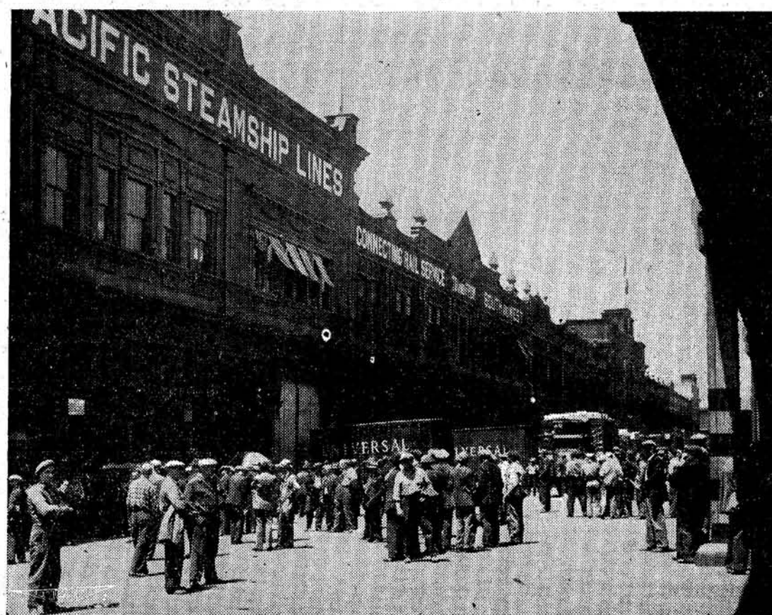
Members of the International Longshoremen's Association (ILA) shown picketing on the New York pier of the Morgan Lines after 500 ILA workers struck in protest against the sale of the Line's entire fleet of 10 ships to the government. The transfer has netted the company $2,300,000, but left the workers jobless.

strike a blow against the unions themselves.