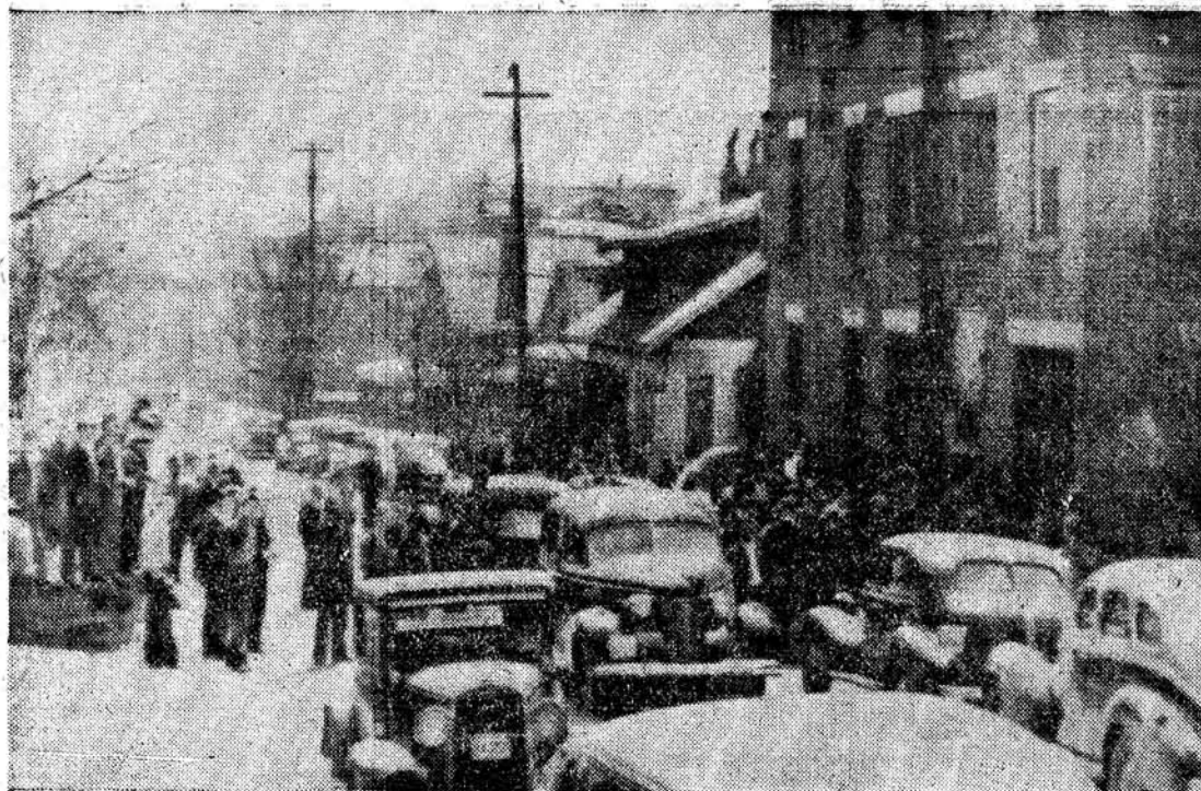
Scene outside the Harlan Hospital, Harlan, Kentucky, where striking members of the United Mine Workers (CIO) are gathered as four dead and five wounded union brothers are being brought in after being machine-gunned from ambush by mine guards and Bloody Harlan officials at the Crummie Creek Mine. Thus four more names are added to the long roll of martyrs whose sacrifices have helped build the UMW union in the United States.