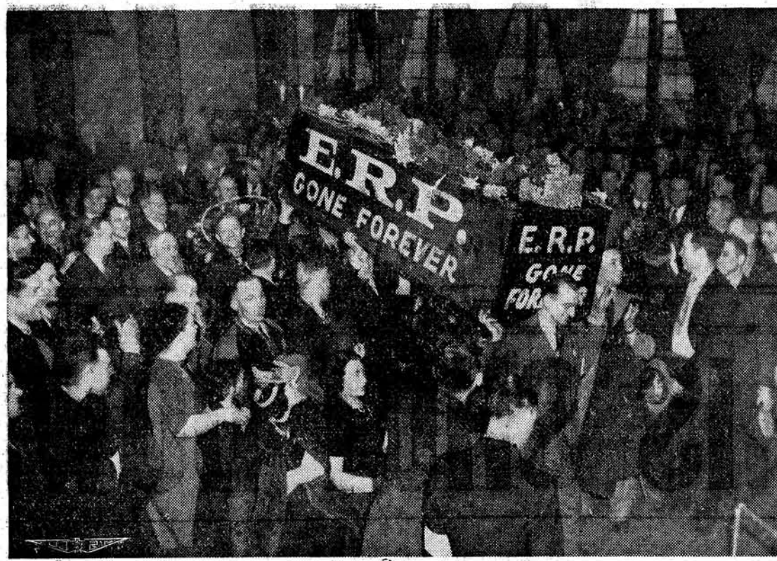
Bearing a coffin containing the "corpse" of the Employees Representation Plan, Bethlehem Steel's company union, jubilant members of the Steel Workers Organizing Committee (CIO) are shown celebrating at their victory meeting after their two-day strike at Bethlehem's big Cambria works in Johnstown, Pennsylvania.