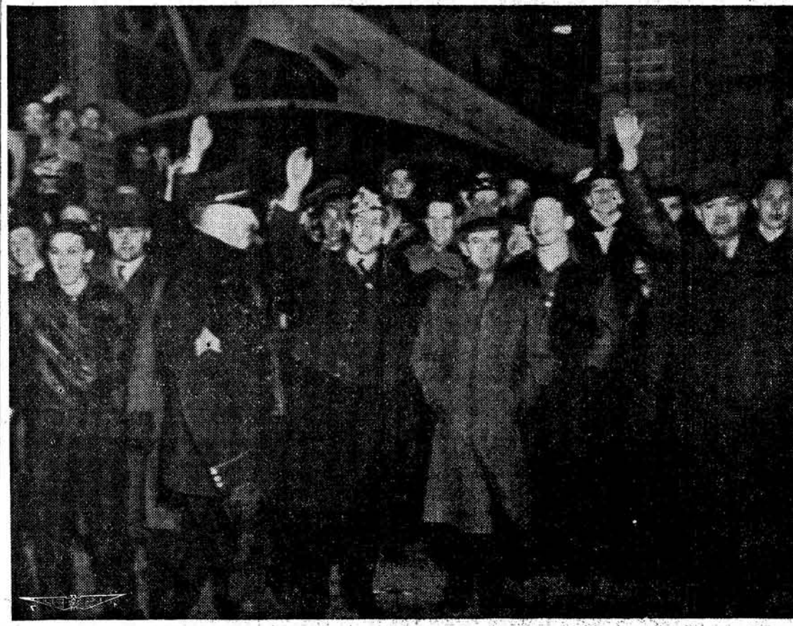
A group of Ford workers, massed at the foot of the stairs leading to one of the overpasses into the River Rouge plant, cheer the news that the Ford Motor Company strike has officially begun. Several of the workers are wearing the famous United Automobile Workers (UAW) caps.

Wednesday 12:15 A. M., fully nine hours after the original disturbance in the rolling mill, the