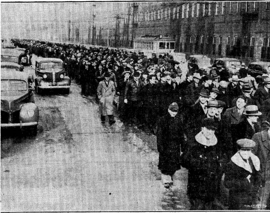
Here are five thousand reasons why the Allis-Chalmers Manufacturing Co., Milwaukee, Wis., didn't turn a wheel in eight weeks. Striking members of Local 248, United Auto Workers (CIO), are shown before the plant on Feb. 24 giving the bosses some idea of their united strength.