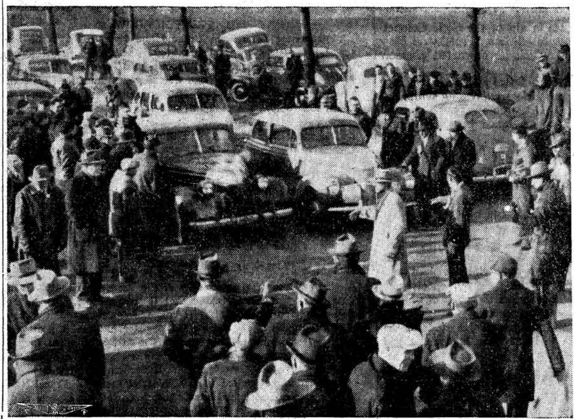
Members of the Steel Workers Organizing Committee (CIO) are seen here as, last week, they halted all cars attempting to enter the gates of the Carnegie Illinois Steel Corp. plant in Gary, Ind., and demanded the showing of a paid-up union card from every worker.

number of Republic Steel workers joined the lines in token of support and solidarity. Members of 65 other CIO locals were also on hand to back up the Lackawanna workers, as well as many AFL members.