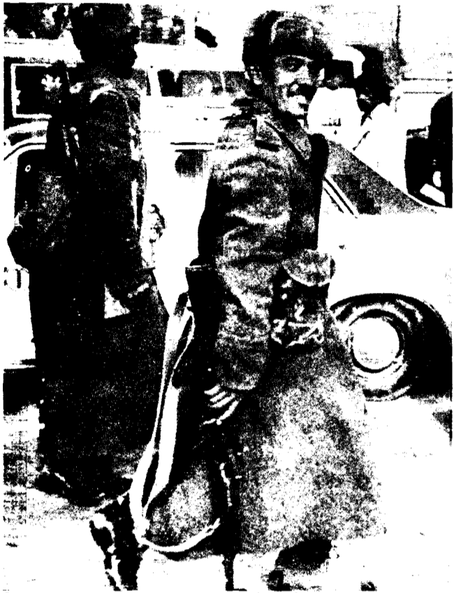
Soviet soldiers patrol village outside Kabul