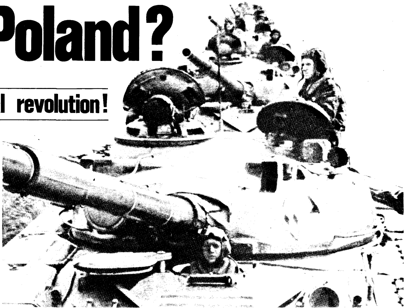
Warsaw Pact tanks in Poland.

The massive strike wave in the Baltic ports last August brought Polish workers before a 'historic choice: with the bankruptcy of Stalinist rule dramatically demonstrated, it would be either the path of bloody counterrevolution in league with Western imperialism, or the path of proletarian political revolution. With the clerical-nationalist influence in Solidarnosc and now the emergence of a mass organization of the landowning peasantry, the counterrevolutionary danger remains great. But a process of political differentiation has begun. Above all, 'Solidarity' has come to embrace the whole of the Polish working class, with all of its ten-