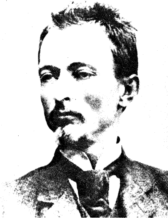
Felix Dzerzhinski, Polish revolutionary and Bolshevik leader.

Most striking is the impact which the workers struggles have had on the Stalinist apparatus of the PUWP. The recent Central Committee meeting at the end of March turned into a political brawl. 'We must know that Solidarity is in the first place the working class itself', declared the party secretary of the Baltic port of Szczecin. Only the fear of the Kremlin's reaction prevented this meeting from throwing hardliners like Stefan Olszowski off the Politburo. A recent national conference in Torun of dissident groupings within the party called for full and adequate information, secret ballots, multiple candidates. One delegate protested: 'The authorities should not present the changes going on in our country as the work of antisocialist forces but as a proper restoration of Marxist-Leninist principles' ( New York Times , 16 April). However, overall the PUWP dissidents are not