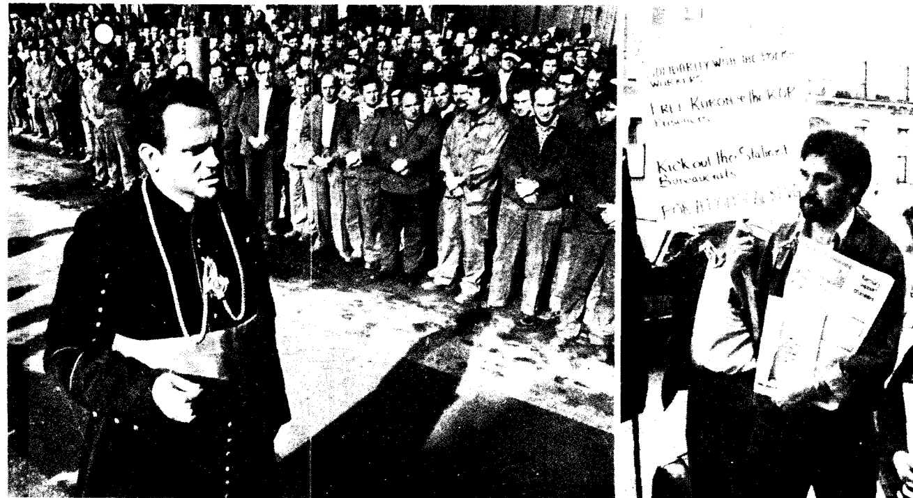
Workers Power opposes capitalist restoration in Poland, but refused to take a stand against Vatican-inspired restorationist danger.

Years of centrist functioning have a debilitating effect on revolutionary integrity and revolutionary will. The cadre of Workers Power have been trained in a bad school -- a school in which adaptation to alien class influences within the proletariat is valued as non-sectarianism, in which programmatic contradictions are hidden beneath appeals to organisational loyalty and personal associations. It is possible to break from that training; Comrade Shell has taken the decisive step, other serious elements in Workers Power will follow. We do not prejudice who those serious elements are. Workers Power can choose to make use of its forthcoming conference to draw the organisational lines like a noose around its neck. Or it can use the opportunity we offer it to engage in a frank debate with cadre of our tendency to allow the programmatic issues to come to the fore. ■