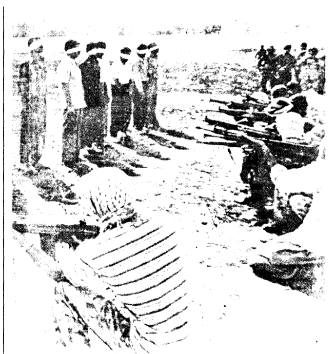
Kurdish militants face Khomeini's hit squad. Workers Power tells Kurds to defend Khomeini's 'revolution'.

The most ludicrous charge made against me was that I 'acted in the manner of a police agent', a charge made at the kangaroo court which confronted me when I arrived home on 30 March. Since when is committing oneself to the defence of the revolutionary programme 'acting in the manner of a police agent'? Since when is collaboration with political cothinkers an act morally repugnant to revolutionaries? All these accusations are sheer hypocrisy on the part of the