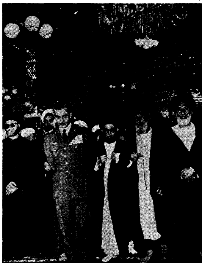
Shah of Iran with entourage of religious leaders

'True, many of the people are under the influence of religious leaders. When all other oppositions were brutally repressed some of the latter provided the only focus for struggle. But whatever the form (and students of English history will recall that Charles I, too, was overthrown by a movement which spoke with a religious voice) the content is clear. The masses do not like the monarchy.'