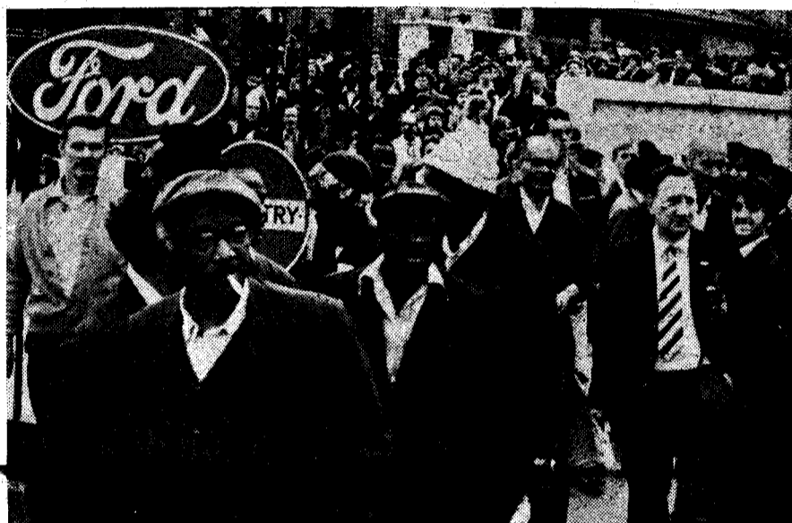
Workers stream out of Dagenham gates after vote to strike

All eyes are now on the Ford strike -- potentially the most important industrial showdown in the last four years of Labour government. Victory at Ford's would be an enormous morale booster for the working class, showing that it is possible to strike against the Labour government and win. With tanker drivers, ICI workers, local government manual workers and many others soon to submit their own claims, the chances of ripping the government's White Paper to shreds would be greatly increased were the Ford claim to be won. Defeat on the other hand could well mean the reluctant acceptance by other sections