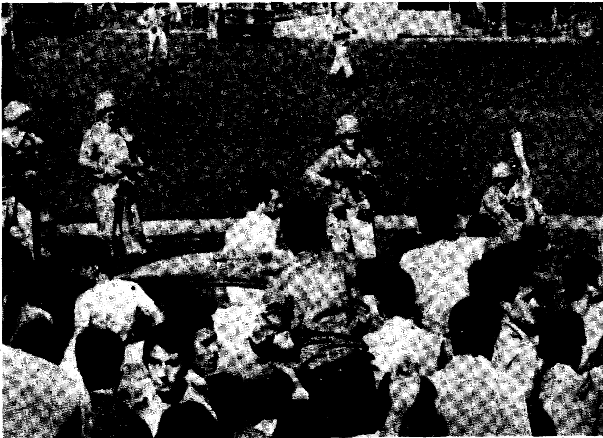
Soldiers confront demonstrators on Bloody Friday

logical sway of Muslim fundamentalists whose idea of a golden age is the expansion of Islam by fire and sword in the sixth century.