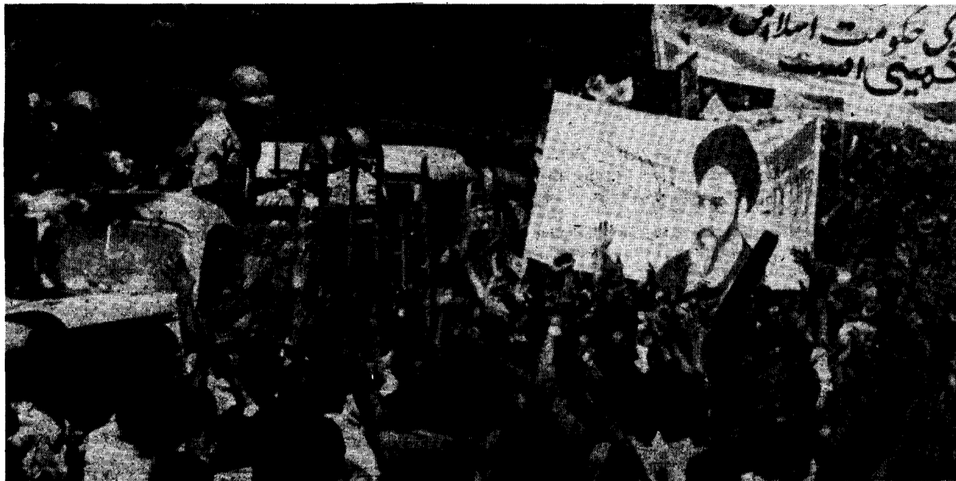
Anti-Shah demonstration in Iran before troops fired into crowd, killing over 1000