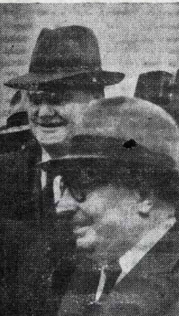
M. THOREZ, FRENCH C.P. LEADER WITH J. DUCLOS.

In other words, the policy of collaboration with the class enemy, of the defence of the bourgeois Republic, of the Constitution which consecrates private property and colonial oppression—all this is to remain the same. The form is to be changed, there are to be elected committees—which the Stalinists hope to control because of their present powerful forces—but in order to continue the same nationalist,