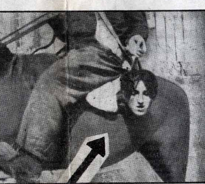
Head of a young Greek is paraded through a Village Street. Corporal Starr saw nine such heads in the parade—eight men's and one woman's.

"They began to beat up men and women in this barracks one day while motor cycle engines were revved up to drown their screams. About thirty women were beaten up on this occasion. One of them