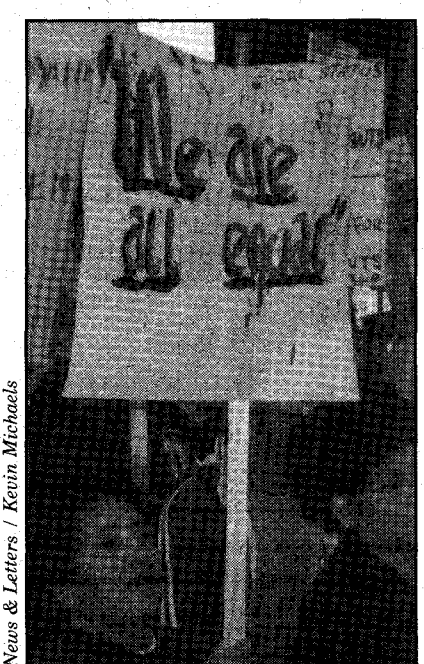
Following stops by the Freedom Riders in San Francisco and elsewhere, supporters rally in Chicago Sept. 27 for immigrant workers' rights.

San Francisco—On Sept. 20, several thousand people rallied here to send off the Bay Area contingent of the national Immigrant Workers' Freedom Ride. "Immigrant work—"Immigrant work—"