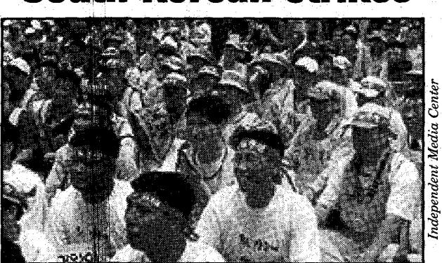
Railway workers rallied during mass labor protests.

During the past few months, South Korean workers have taken advantage of the limited political space opened up by the election to the presidency of Roh Moo Hyun, who has been slower to crack down on labor than previous leaders. After bank workers won a small victory in June against international capital, railway workers followed suit by shutting down 90% of freight and 50% of passenger service in a four-day strike.