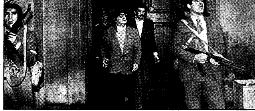
Salvador Allende last seen alive, Sept. 11, 1973.

gained power, for making sure workers' control of production and not just the nationalization of industry would be the only guarantee socialism. This was a sure way of guaranteeing that instead of a civil war, we would have a massacre.