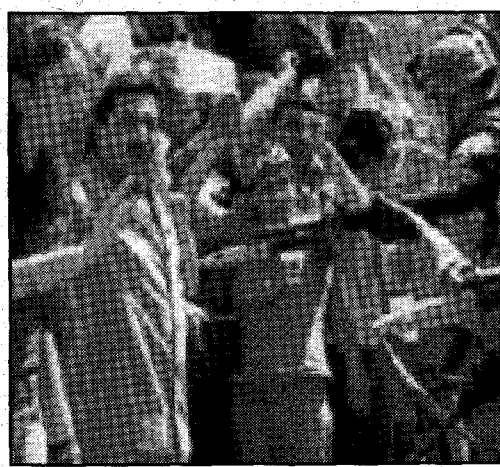
still Women's rights activists from OWFI particrequires ipated in the Unemployed Union's demonstration in Baghdad on July 29. struggle

OWFI's Statement of Founding begins: "Women's freedom is the measure of freedom and humanity in society. Not only in Iraq, where women endure the most severe types of discrimination and injustice, but