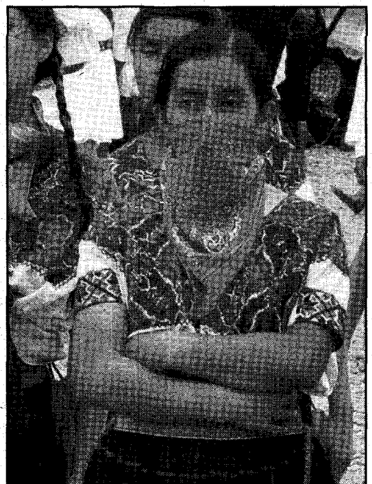
tions between Zap- Participant in Oventic, Mexico, gathering.

On Jan. 1, 1994, the Zapatistas timed their uprising to coincide with the initiation of the North America Free Trade Agreement (NAFTA), part of a long line of neoliberal business plans that impoverished Mexican (and U.S.) rural areas. NAFTA allowed U.S. agribusiness to flood the Mexican market with low quality,