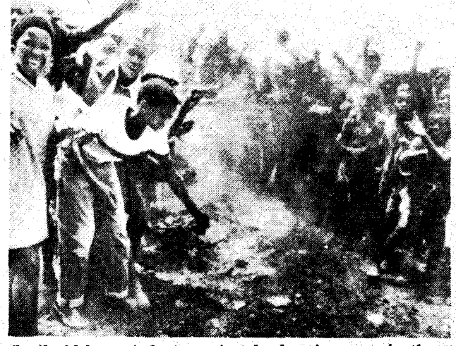
South African students protest by burning examinations.

Hundreds of Black Zimbabwe youth are answering the latest attempts to stall majority rule in southern Africa by joining en masse the guerrilla forces training in Botswana and Zambia.