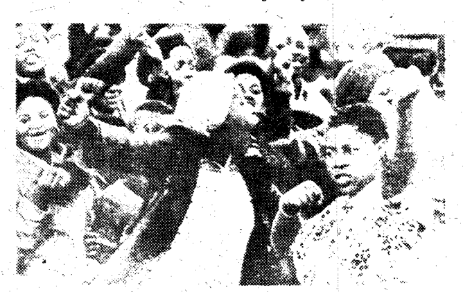
South African women, today as in the past, are in the forefront of the struggle for freedom.

Singing freedom songs and carrying placards reading, "Don't bring your disguised American oppression into Azania", Black students in their early teens gathered in the school yards of Soweto on Sept. 17 to protest Henry Kissinger's visit to Pretoria—to supposedly discuss a "peaceful transition" to "Black majority rule" with two