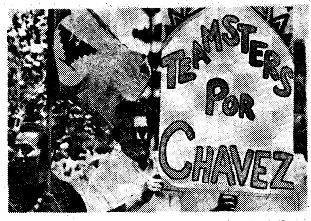
California cannery workers support UFW strikers

picket line every morning, a driver contracted by the Army to deliver the vile vegetation refused to cross the UFW picket line. He told the picketers he had 800 boxes of scab lettuce, and he was turning right around with them.