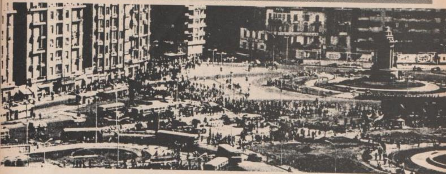
Cairo, January 1972. Students attempt to assemble for demonstration against Sadat regime.

tion save one: The Arab Trotskyists have always defended the ACO against repression by the bourgeois Arab regimes. The fundamental political differences between the Arab Trotskyists and the OCA over such questions as terrorism are no secret, for they have been discussed often enough in the revolutionary Marxist press in the Arab world.