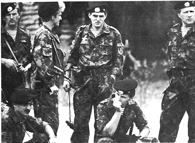
Interior Ministry's Black Berets: no future under Yeltsin

for the forces of counterrevolution because it signified that henceforth political power would be exercised by those unambiguously committed to the restoration of private property in the means of production.