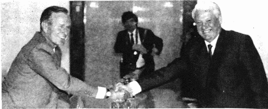
Bush & Yeltsin: counterrevolutionary axis

of capitalism, and differed only over the political means, the working class should favor the victory of the faction that sought to restore capitalism by less repressive methods. This, as we shall see, is the only logical argument offered by any of the so-called Trotskyists who refused to block with the coup leaders. Only its major premise—that the aims of the coupists and their adversaries were the same—is false.