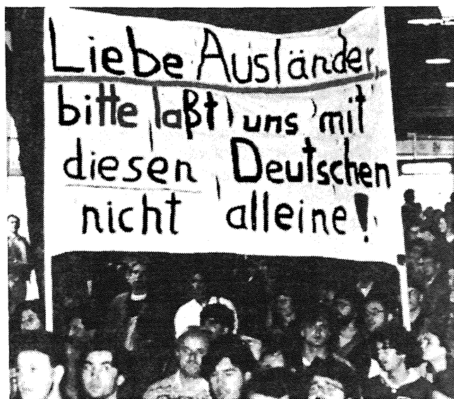
“Dear Foreigners, please don’t leave us alone with those Germans!”

If the German bourgeoisie has no need to turn to Nazi thugs for salvation, it also recognizes that the