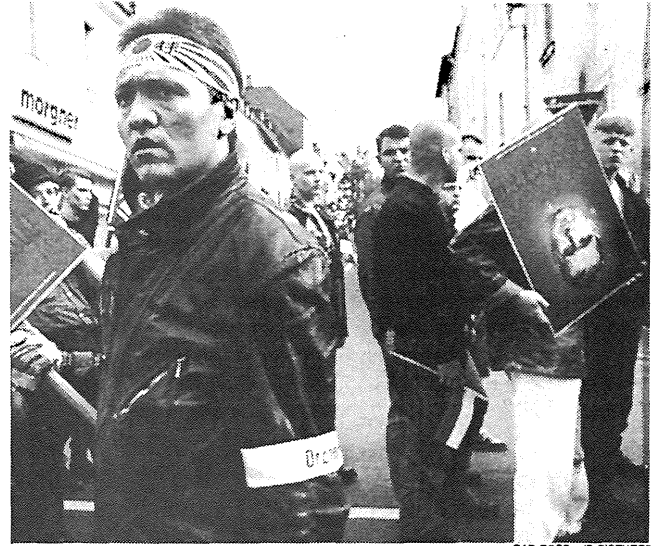
Nazis celebrate war criminal Rudolf Hess

For the first few weeks there was no organized resistance. Then some liberals and clerics sponsored pacifist vigils ( Mahnwachen ) where citizens gathered in front of asylum centers to show their sympathy with the victims. While those who participated in this activity were certainly well-intentioned, this passive moral witnessing probably did little to deter the fascists. The large-scale attacks were apparently suspended as a result of