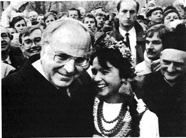
Kohl visits (Polish) Silesia, 1989: "Even the stones speak German"

already sets the tone in Europe—and the planned 'EC 92' will further consolidate Germany's position."