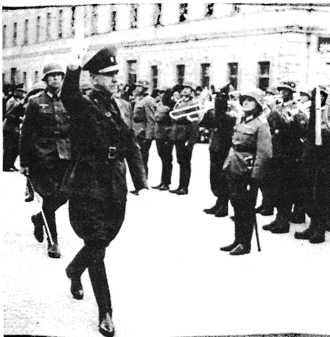
Ante Pavelic: head of Nazi puppet state in Croatia

mations in this conflict. The rapidly deteriorating living standards of workers have produced significant opposition within Serbia. Milosevic has attempted to suppress opposition to the war, but thousands of Serbian soldiers have deserted or have gone into hiding to avoid being dragooned into the squalid conflict. Last October Montenegro, Serbia's closest ally, came out against the use of its reservists in the campaign against Croatia.