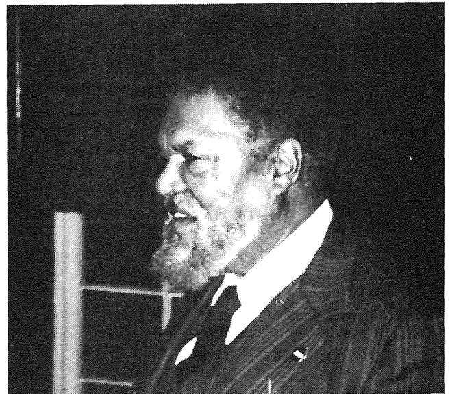
Robert F. Williams