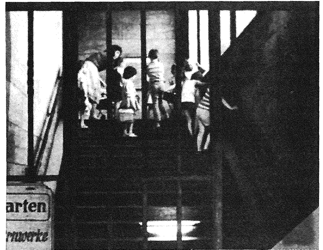
Factory daycare cut back after reunification

Yet, unlike the former degenerated and deformed