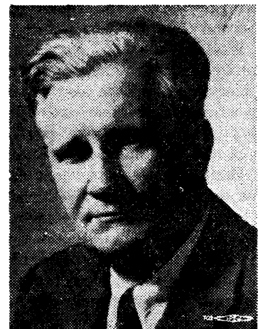
JAMES P. CANNON National Chairman Socialist Workers Party

It appears to me now, in the light of the conflict in the party and its real causes which are now manifest, that those sections of the Convention Resolution, dealing with the class as