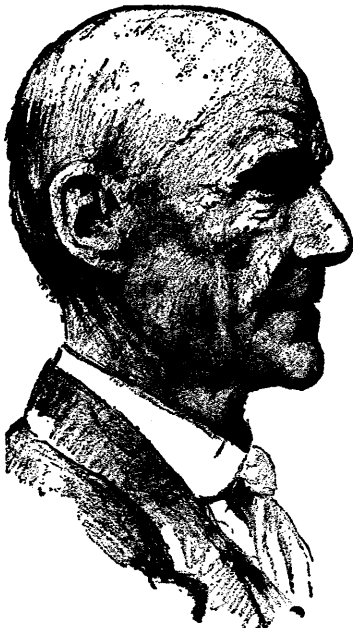
EUGENE V. DEBS