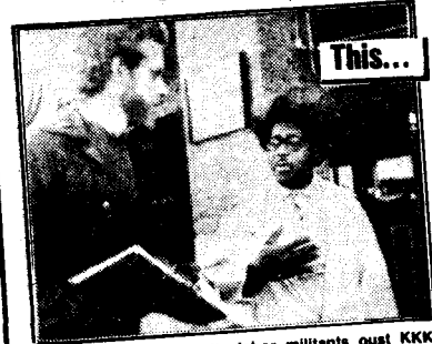
Detroit: Black and white labor militants oust KKK-hooded foremen from River Rouge.