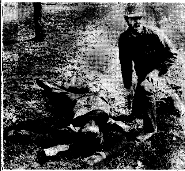
After the Greensboro massacre: Anti-Klan protester leans over body of fallen comrade.

organized race-hate murder and mass unemployment.