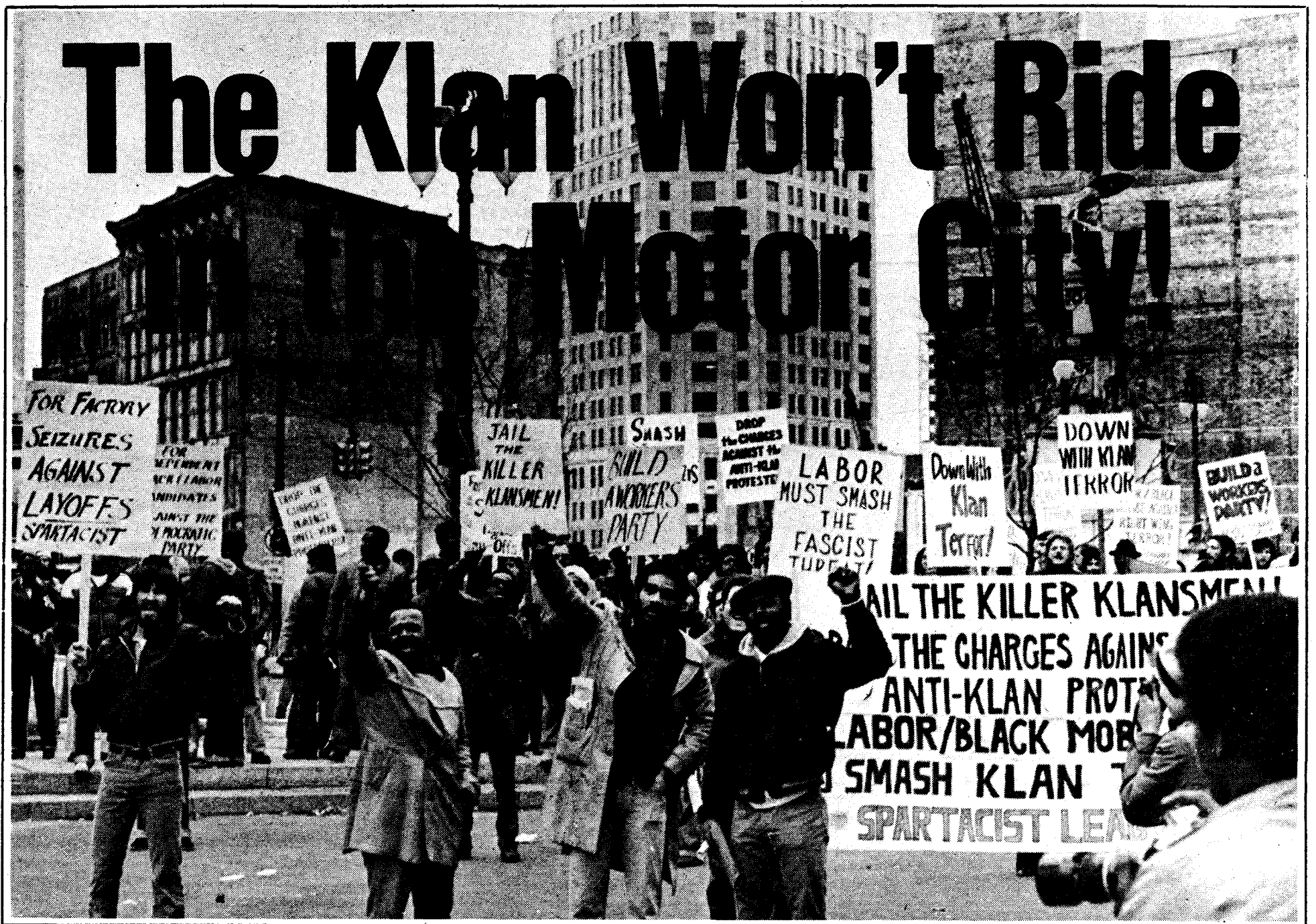
Australasian Spartacist is pleased to be able to reprint as a supplement this special report on the anti-Ku Klux Klan demonstration held in