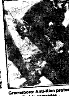
Greensboro: Anti-Klan protest. Klan kills his comrades.

The Klan said they're turning in Kennedy Square to celebrate their Greensboro, North Carolina killings! We're going to Kennedy Square to oppose Klan terror and murder! Mayor Coleman Young said we who oppose the Klan have no more rights than the KKK killers, that we should not show our faces on fear of arrest. We say no to Coleman Young and Coleman Young better think about it. The Klan-Nazi race killers must be stopped while we still can. Make Coleman Young back down. He wasn't elected by Georgia cracker Jimmy Carter but by black votes. This town is filled with hard-working, mainly black auto workers.