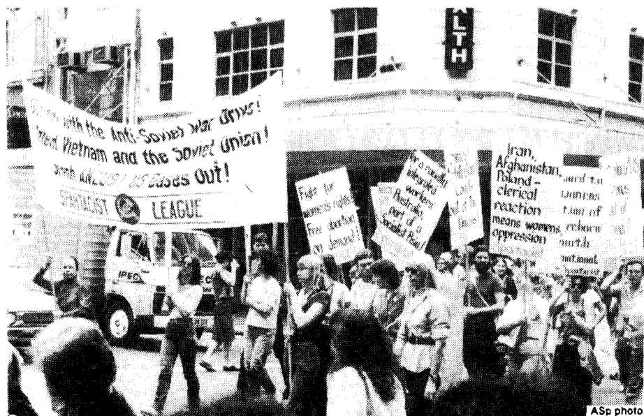
Spartacist contingent at 1984 Sydney International Women's Day march.

Now I'm a foundation member of Children by Choice, which is an