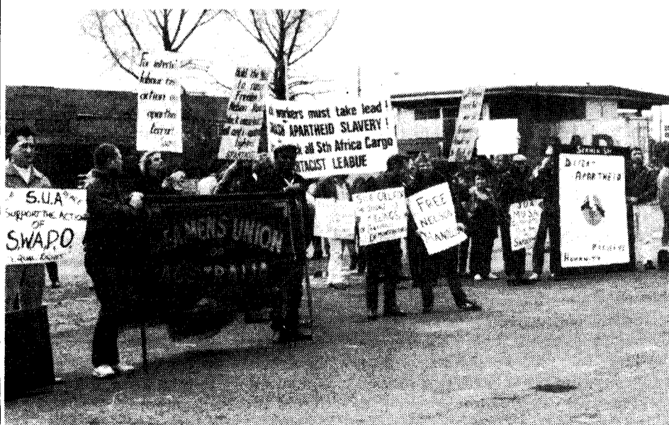
70-strong picket against Saffocean Mildura, Melbourne, 5 August.

MELBOURNE, 5 AUGUST — A 70-strong picket was held at South Wharf today in support of bans by waterside and maritime workers against the Saffocean Mildura, a Dutch-registered South African freighter. In the wake of apartheid fuhrrer PW Botha's declaration of a "state of emergency", the bans were kicked off in Sydney in late July by the Waterside Workers Federation, followed by similar 24-hour actions by Firemen and Deckhands (tugmen), the Seamen's Union and watchmen of the Miscellaneous Workers Union whose picket line delayed the ship's departure when the linesmen refused to cross. When the Mildura arrived in Melbourne on 1 August it was again struck