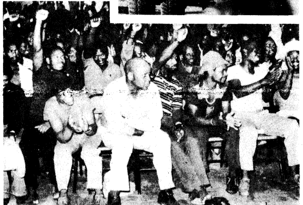
Repression sharpens (top); black miners union meeting (above).

Police breaking into homes, death squad executions of black school teachers, dumping bodies in the sand dunes along the Indian Ocean, hippo armoured troop carriers rolling through the black townships spreading terror — this is the "free world regime" Ronald Reagan says will be "reformed" through his "constructive