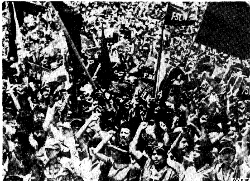
"We Won't Sell Out, We Won't Give Up! Nicaragua Will Be Reagan's Grave!" Half a million Nicaraguans in Managua's Carlos Fonseca Plaza celebrate sixth anniversary of their revolution, 19 July.

In addition to mass mobilization into the army and militia, special mobile units, anti-tank and anti-helicopter units and elite special forces units have been created in recent months,