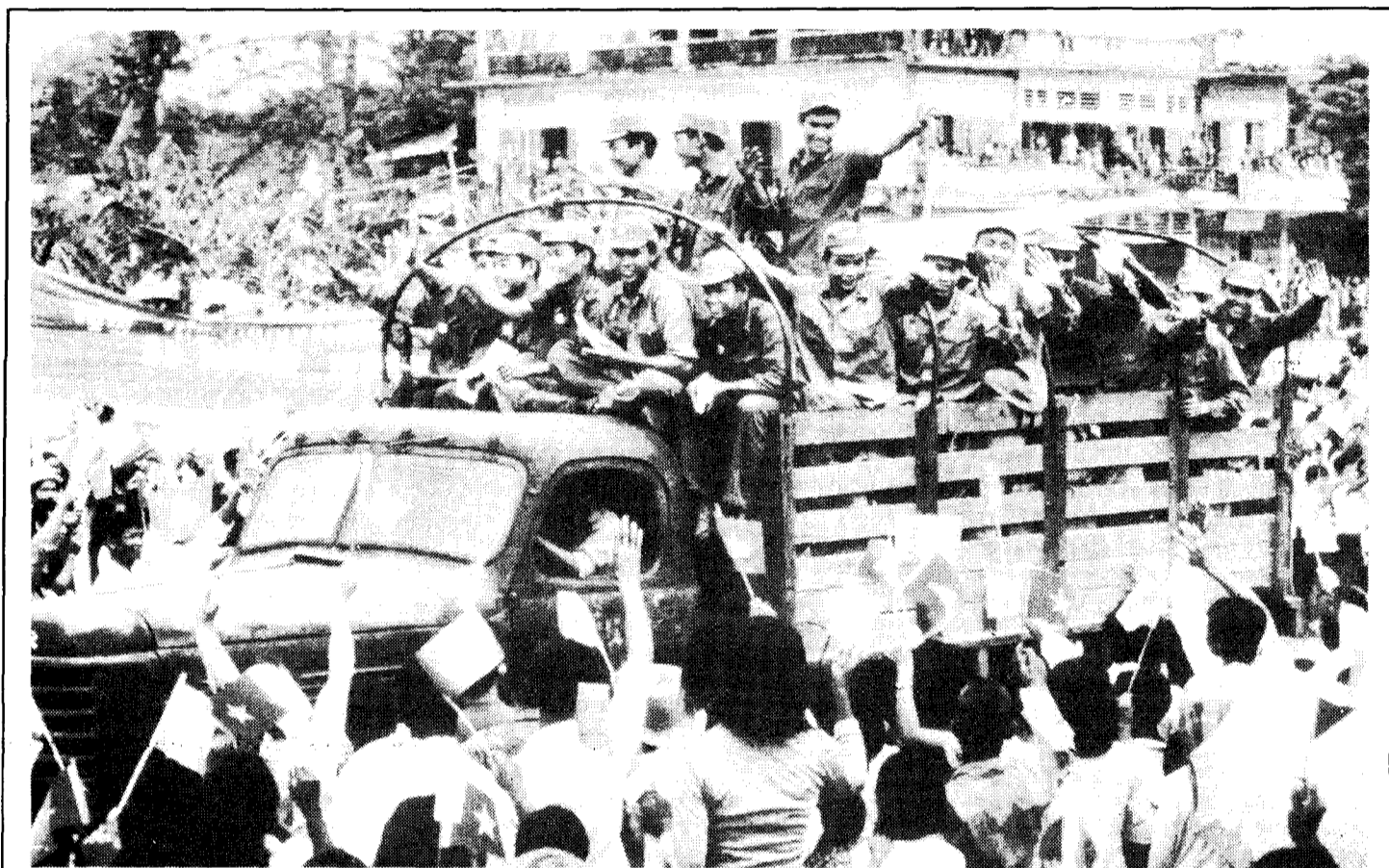
Kampuchean troops hail Vietnamese troops returning to their homeland after crushing anti-communist guerilla bands on Thai border.

Nevertheless the Vietnamese Stalinists pursue the pipedream of