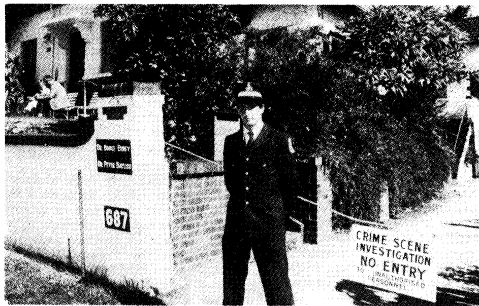
Police close down Greenslopes clinic after 20 May anti-abortion raid.

Wainer: We've had a number of attacks. We've played them down. We had a little episode in the mid-seventies where a car parked out there was burned down and about a fortnight later one of our windows was broken and a petrol bomb thrown in, and I didn't pick it up. I don't know what was wrong with me, I was probably pre-menstrual or something. The bell didn't ring. A fortnight later someone actually did break in and threw a sort of molotov cocktail into one of our theatres. Now they made a terrible mistake because they closed the theatre door as they went out and that contained the fire. The one