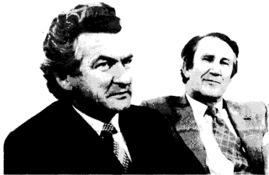
Bob "human rights" Hawke, as loyal a servant of capitalism as Malcolm Fraser.

What better issue on which to make a diplomatic debut than that of "human rights" for