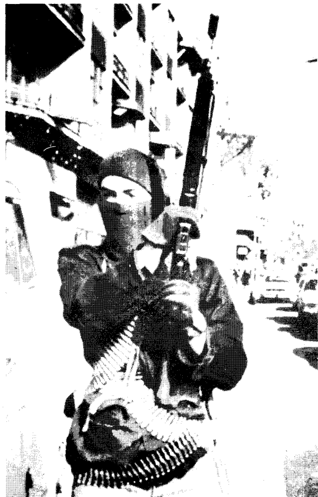
Soldier of Khomeini's New Revolutionary Army patrolling Teheran street in February.

The Forghan assassinations were also the spark for the regime's confrontation with the press. Ayandegan , one of Iran's daily newspapers, has been a forum for mild leftist and liberal criticism of the new regime. But when the paper published the manifestos of the Forghan Fighters, which denounced the "dictatorship of the mullahs" in the name of Islam, it drew the wrath of Khomeini himself. In short order Muslim thugs destroyed or confiscated bundles of Ayandegan and occupied or sacked its offices across the country, denouncing the paper as simultaneously "Communist", "Zionist" and "satanic". By 12 May Ayandegan was forced to suspend publication. Next came the turn of Kayhan , second of the three leading Teheran dailies, whose Islamic workers