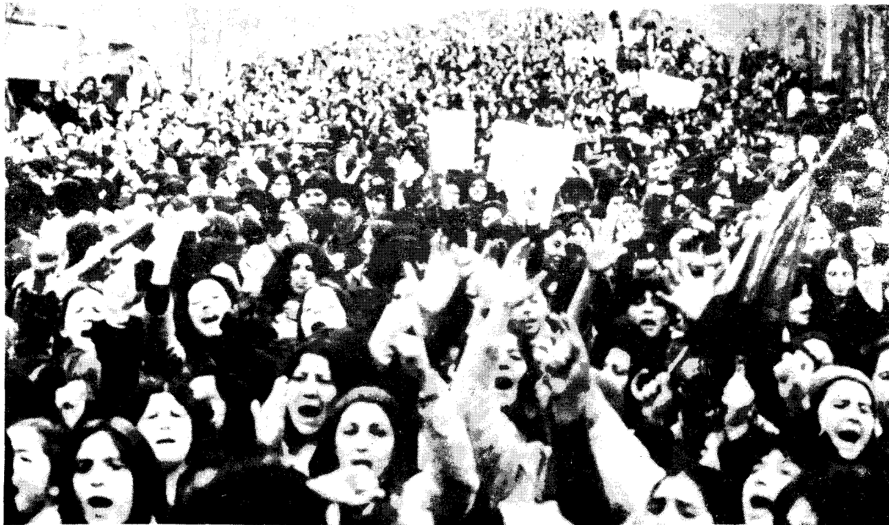
In March, thousands of women took to the streets to protest against Khomeini's attempts to reimpose the veil.

As in tsarist Russia, where the Great Russian minority of 47 percent dominated a huge empire, so it is in Iran today. Historically, this prisonhouse of peoples -- where only two-fifths of the population is Persian -- is a tinder-box for revolutionary-democratic agitation. In the post-1917 period revolutionary ferment swept through the northern provinces bordering the USSR and short-lived "democratic republics" were established in Azerbaijan and Kurdistan under the tutelage of Soviet occupation forces at the end of World War II. But under the mullahs, just as under the shah, the national demands of Khuzistan Arabs, the Kurds, Turkomans, Azerbaijanis and Baluchis are viciously suppressed. It is in the assaults against the national minorities that Khomeini -- in league with remnants of the shah's army -- is forging the new