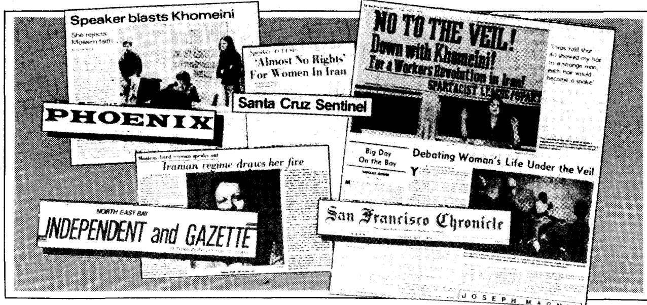
US press coverage of Fatima Khalil tour highlighted SL's unique Trotskyist line on Iran.

"The Koran says if you show your finger to a strange man, you have to cut it off. Because