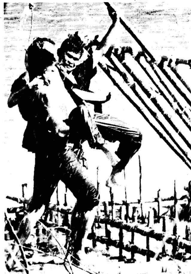
The Deer Hunter lies: NLF captors throwing GI into tiger cage. Cimino wants his audiences to unlearn the truth.